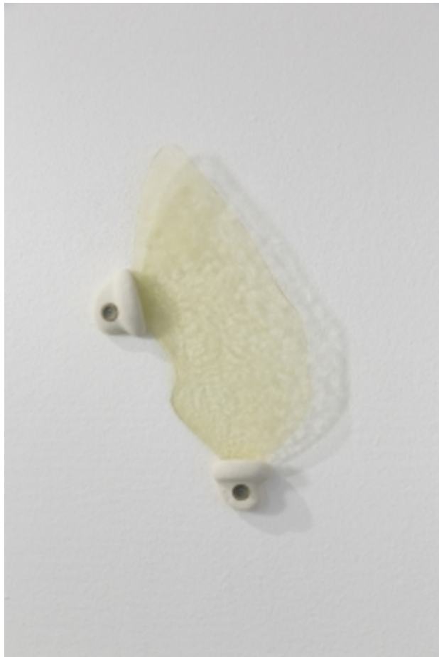
'Untitled', 2014 Indoor climbing grips, custom cast glass, 41x19x4