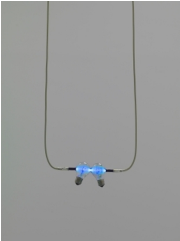
'Untitled', 2014 argon gas, light bulbs