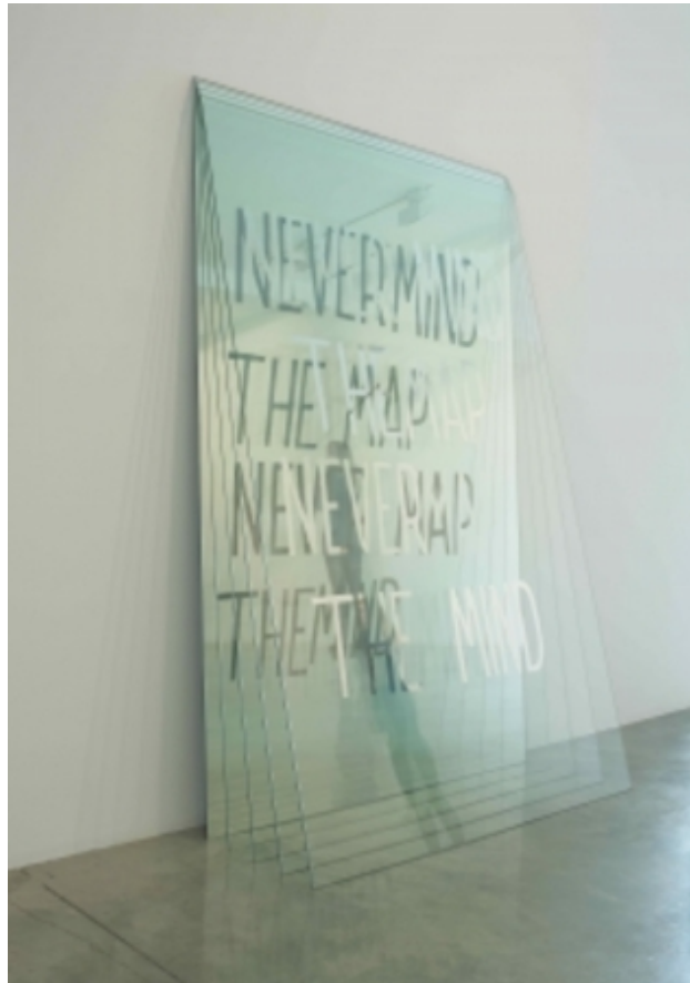
'Untitled (Never mind the map never map, 2013 scrubbed mirrors