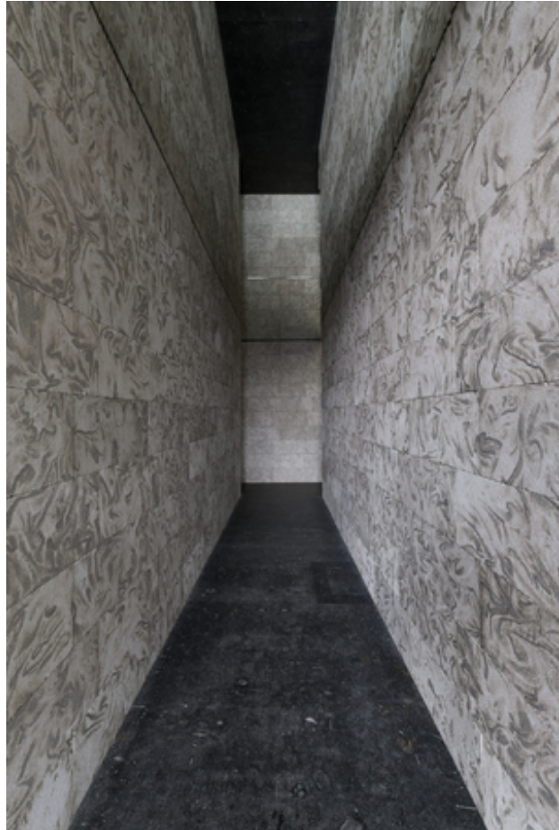
Stride 2017 - 2018, 2018 ytong blocks, aluminium rooftop coating, mirrors, dimensions variable