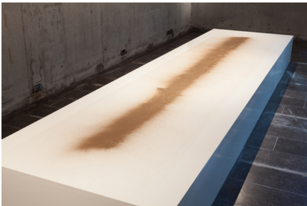
Post Parallelism 2017, 2017 Meteorite dust, moonwalk, dimensions variable