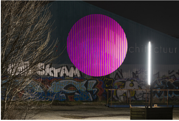
Our Dot 2010-2019, 2019 reflector tape, lights