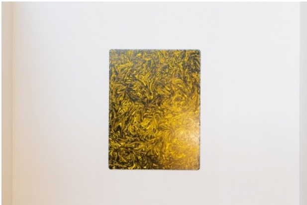
'The Main Remain' 1988-2014, 2014 reflecting sheet, metal, black block out, 132,5 x 110,5 x 2,6 cm