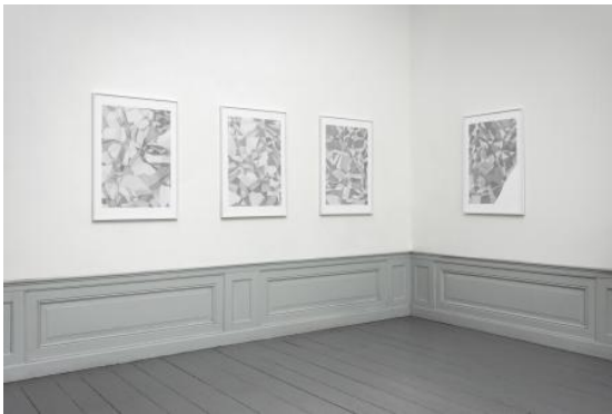
Current Knowledge, 2022 pencil on paper, each drawing 83 x 59 cm