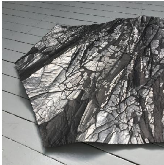
Rough Cut No. 3, 2022 graphite on paper on foil, detail