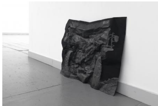
Komatsu Krumple, 2022 silkscreen on paper on foil, 50 x 65 cm