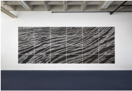
Other Orebody, 2020 graphite on paper on foil, 503 x 191 cm