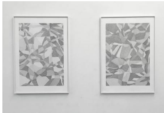
Current Knowledge, 2022 pencil on paper, each drawing 83 x 59 cm