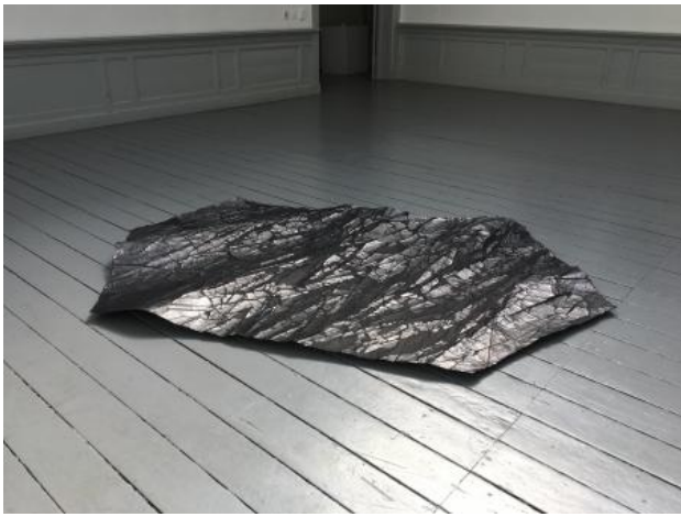
Rough Cut No. 3, 2022 graphite on paper on foil, 140 x 235 cm