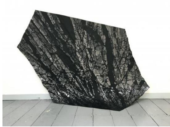
Rough Cut No. 2, 2021 graphite on paper on foil, 140 x 220 cm