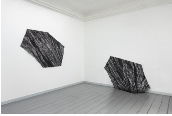
Rough Cut No. 1 (left) and Rough Cut No. 2 (right), 2021 graphite on paper on foil, 140 x 200 cm and 140 x 220 cm