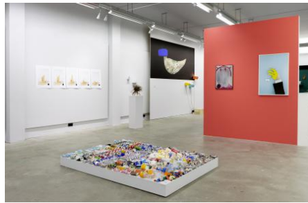
MUDDY PINK DINOSAUR, de tentoonstelling , 2022