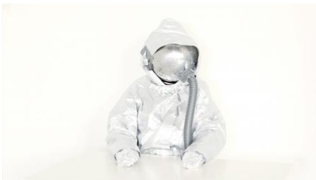
Videostill uit Space S, 2022 video 05:28 min., variabel