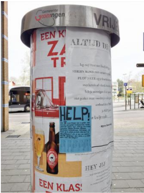
Project MUDDY PINK DINOSAUR, 2021