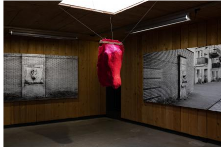
MUDDY PINK DINOSAUR, de tentoonstelling , 2022