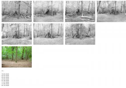
Haags Organisch Openlucht Volks Museum (archief), 2021