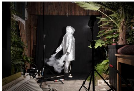
Me, on my way to space, 2021 fotografie, variabel