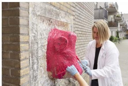
Project MUDDY PINK DINOSAUR, 2021