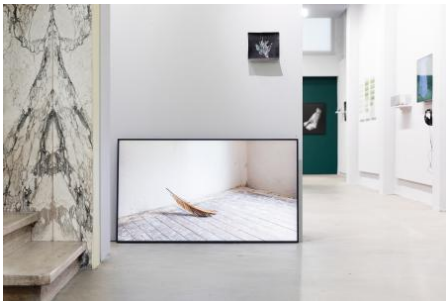
MUDDY PINK DINOSAUR, de tentoonstelling , 2022