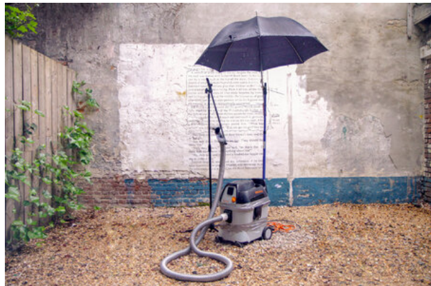
Untitled (sculpture with vacuum cleaner), 2012 Installation. Vacuum cleaner, umbrella,