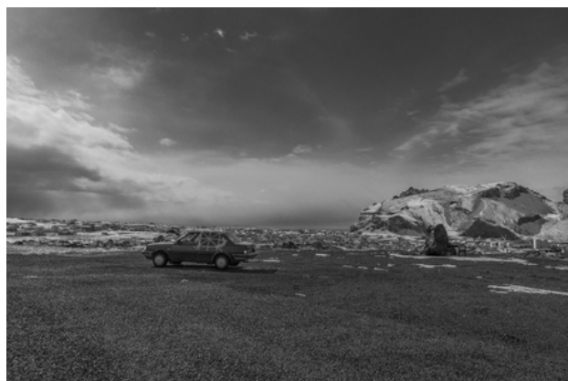
Untitled (R.S.), 2015 Digital photography, image editing, software, variable