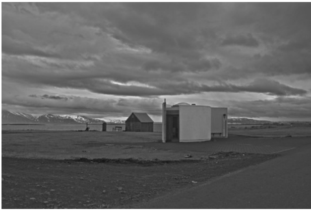
Untitled (R.S.), 2015 Digital photography, image editing, software, variable