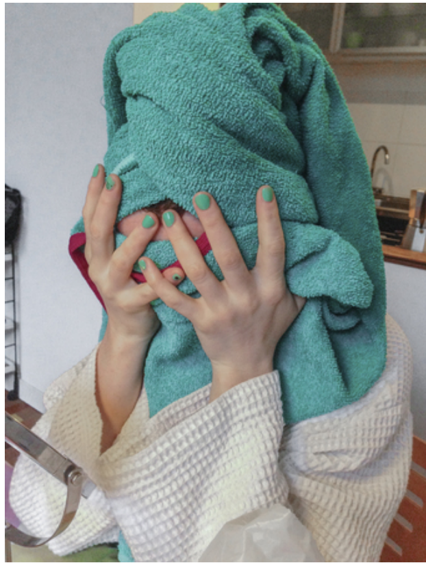
Untitled (portrait study), 2014 Digital photography