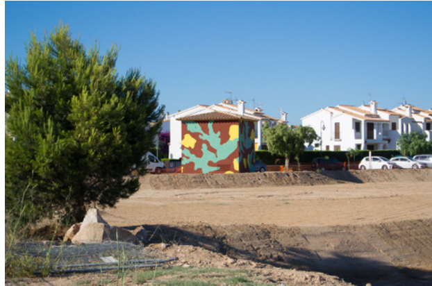
Untitled (M1929), 2017 Installation. Mural paint