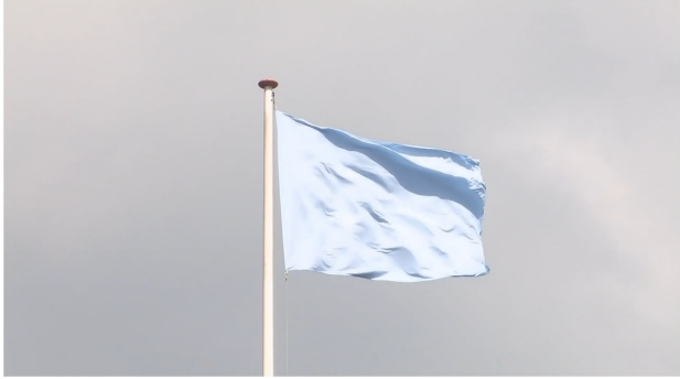
Untitled (Flag #2), 2011 23'