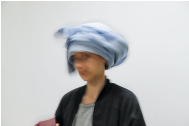
Untitled (after J.V.), 2013 Digital photography