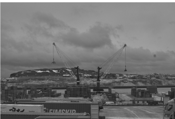
Untitled (R.S.), 2015 Digital photography, image editing, software, variable