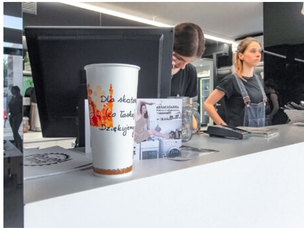
Spectrum, 2016 Performative installation, Burger King paper cup, mar