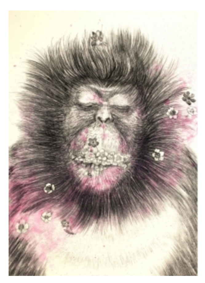
IWAZARU - Speak No Evil, 2012 Lithography, 65 by 50