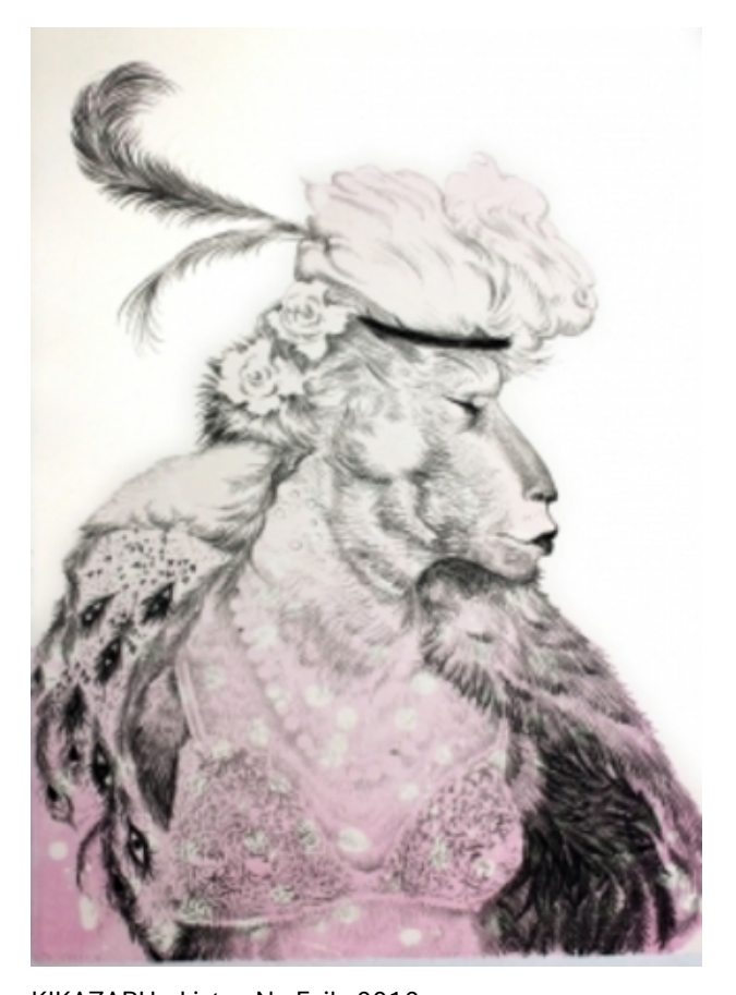
KIKAZARU - Listen No Evil , 2012 Lithography, 65 by 50