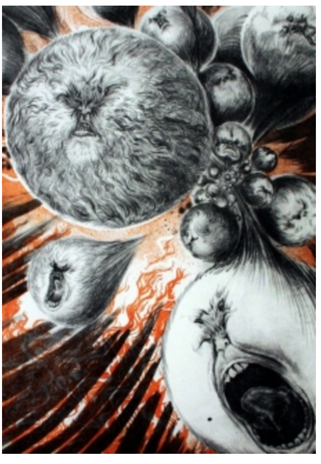
What a beautiful anger!, 2007 Lithography, 100 by 70