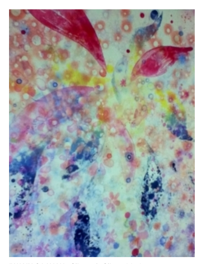
IWANU GA HANA- Silence is Silver, 2013 Lithography, 65 by 55