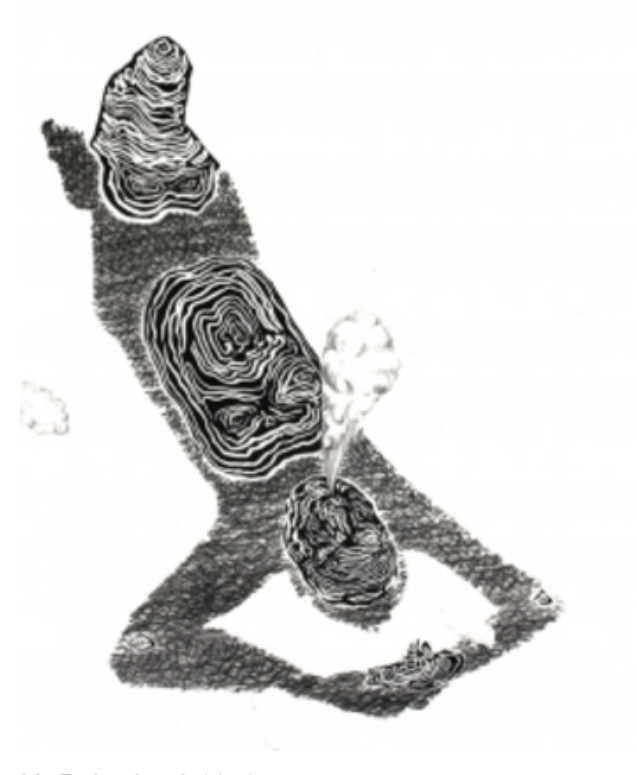
My Father Land, 2012 Lithography, 56 by 38