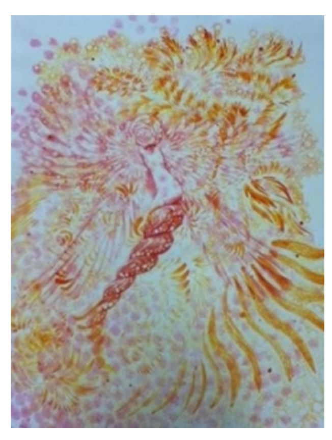
Fire Bird, 2014 Lithography, 65 by 70