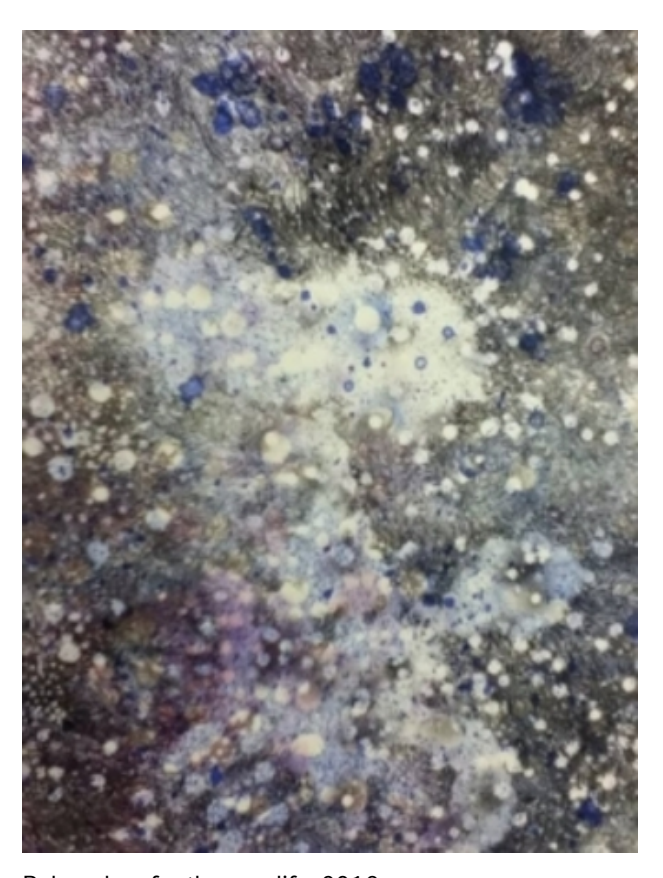
Pukupuku - for the new life, 2013 Lithography, 65 by 50