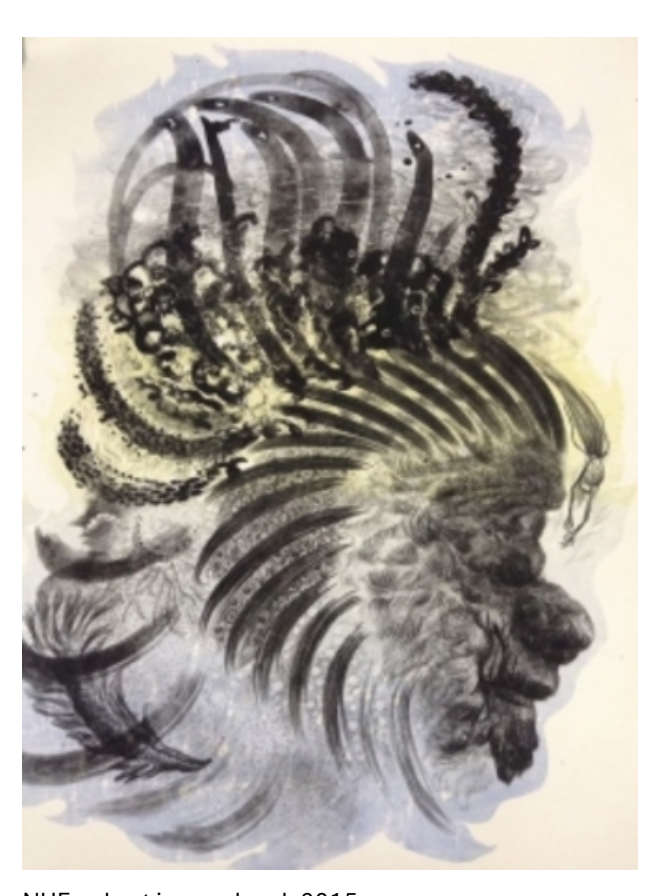
NUE - ghost in your head, 2015 Lithography, 100 by 70

2009 - -- Give museum guide and lecture for tourist