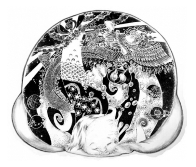
Dream, 2008 Lithography, 75 by 75