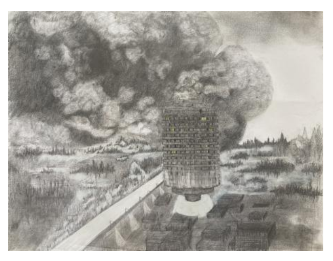
evidence of failure series, 2024 graphite on paper, 70x 50 cm