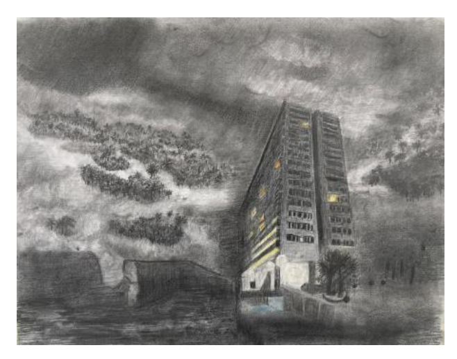
"Evidence of Failure" , 2024 Graphite on paper, 70 \times 50 cm