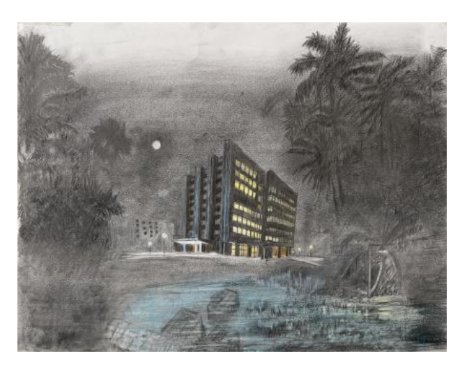
evidence of failure series, 2024 graphite on paper, 70 x 50 cm