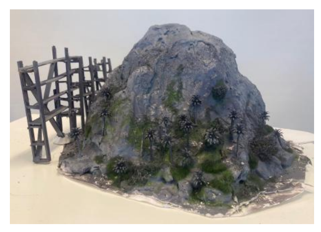
" Evidence of Failure series", 2024 plaster, foam, balsam wood, spray paint, paper mache, trees , 50 \times 50 \times 70 \text{ cm}