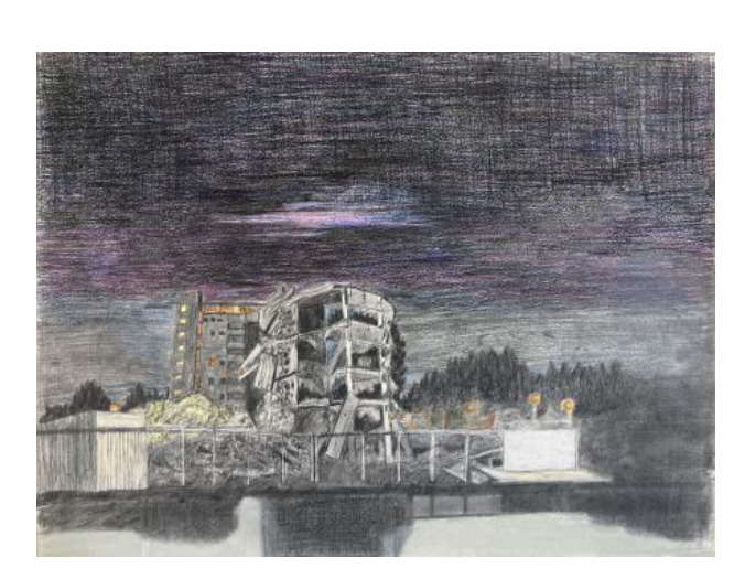
evidence of failure series, , 2024 graphite on paper, 70 x 50 cm \,