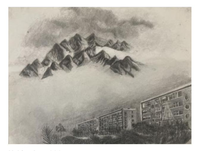
Habitat lost, 2024 graphite on paper, 70 x50 cm