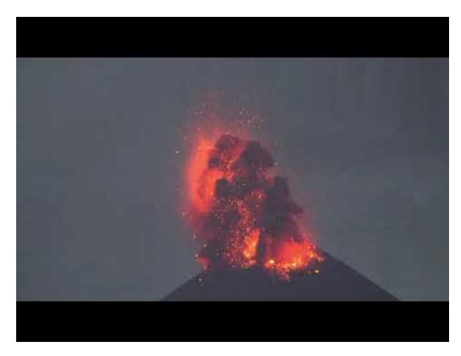
oppossing mirrior, 2023 5 mins