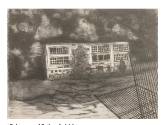
"Evidence of Failure", 2024 Graphite on paper, 100 x 70 cm