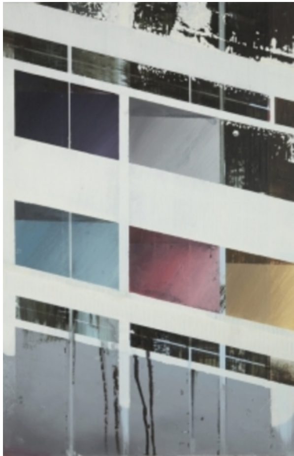
Unité, 2013 olieverf op paneel, 61 x 40 cm