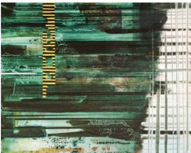
Error, 2016 acryl & olieverf op paneel, 130 x 140 cm