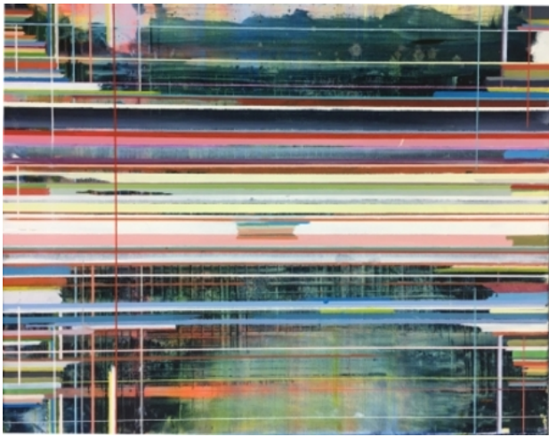
Defect, 2016 acryl & olieverf op paneel, 130 x 140 cm