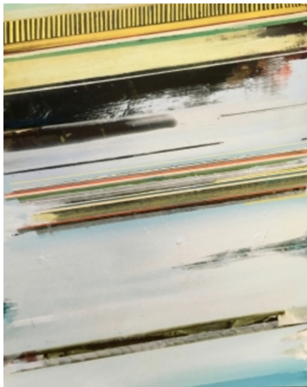
Shorewall, 2016 acryl & olieverf op paneel, 120 x 100 cm