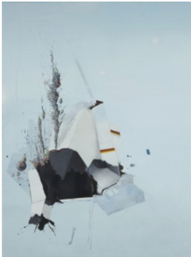
Under Pressure, 2013 olieverf op doek, 190 x 140 cm