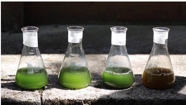
Final Sharing Event Advanced Master of Research in Art & Design, September 2020, 2020 15:58