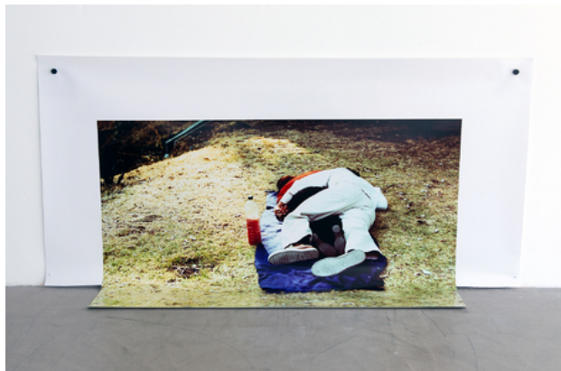
Students at the Universidad Nacional Autónoma, Mexico City, 2018 analoge kleurenfoto (cross ontwikkeld negatief), 120 x 200 x 20 cm.