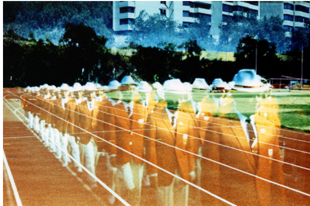
Marching 1968/2018, 2018 analoge dubbelopname (cross ontwikkeld negatief), 80 x 120 cm.