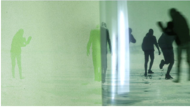
a stone has to breathe, 2021 3:57