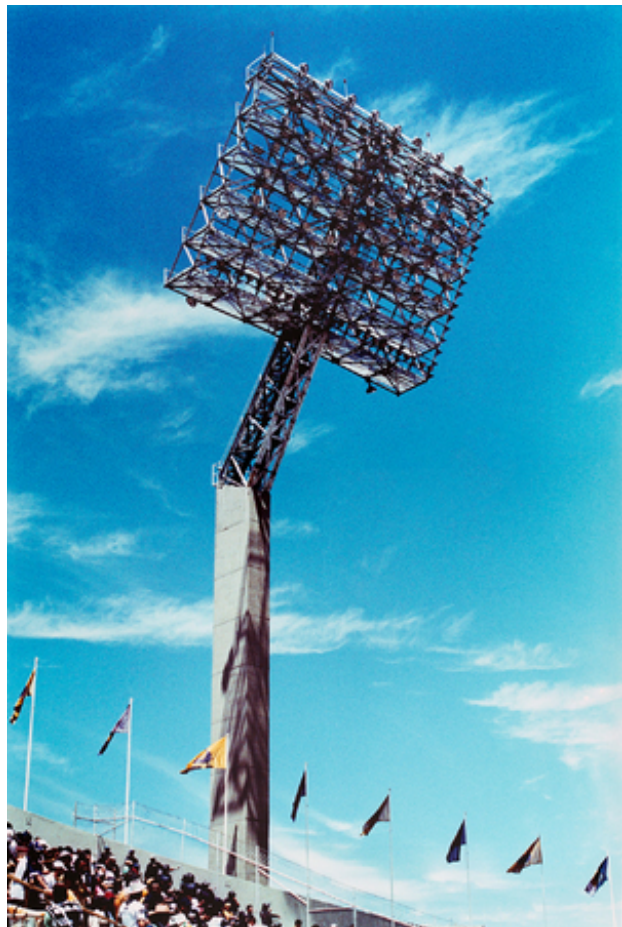
Olympic Stadium (inside), Mexico City, 2018 analoge kleurenfoto (cross ontwikkeld negatief), 120 x 80 cm.