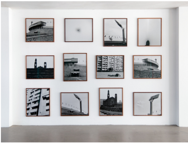
Olympic Stadium (outside) and Plaza de las Tres Culturas (Tlatelolco), Mexico City, 2018 12 analoge zwart/wit foto's (ingelijst), ieder: 50 x 60 cm.