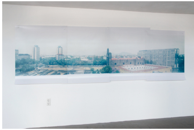
Panorama of Plaza de las Tres Culturas (Tlatelolco), Mexico City, 2018 4 analoge kleurenfoto's, 120 x 400 cm.