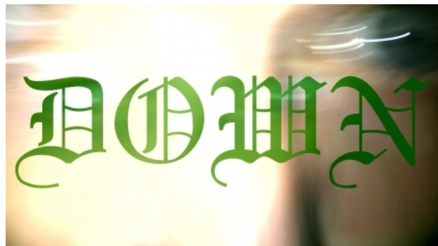
down, 2013 hd video