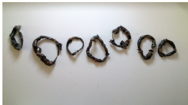
O's, 2013 sculpture