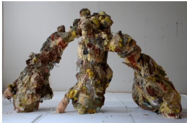
m, 2011 sculpture