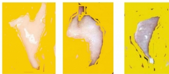
degradation, 2013 photography