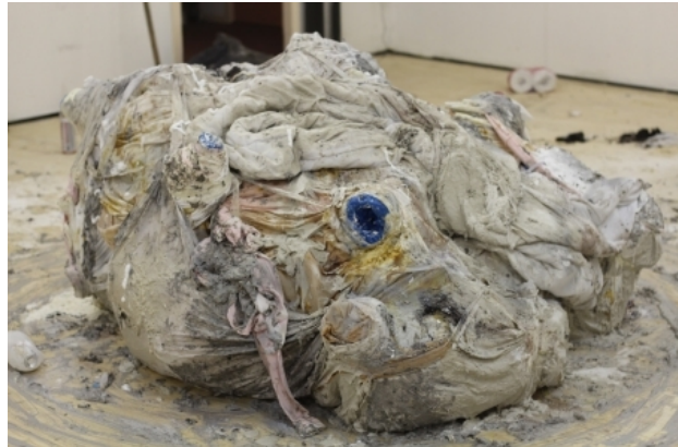
Gray, 2012 sculpture/performance