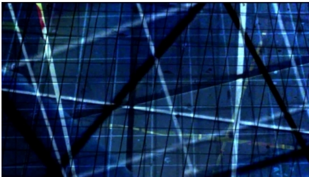
Grids, 2012 hd video