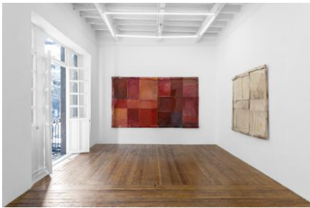
The Good, The Bad and the Ugly , 2025