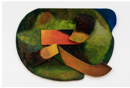
2B Van Gogh and then Murray , 2023 cardboard, resin, paints, pigments, bolts , 190x110x10cm