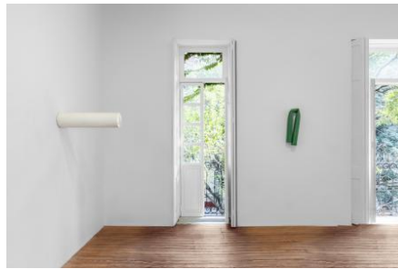
The Good, the Bad and The Ugly , 2025