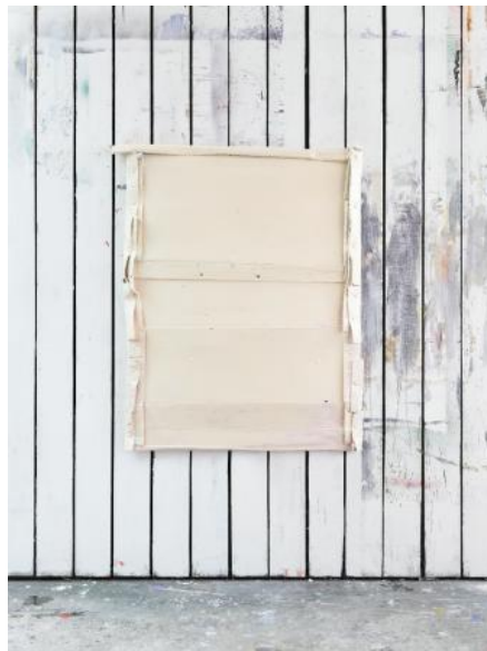
Crushed Box (creme) , 2023 cardboard, resin, pigments, paint, bolts, 150x90x5cm