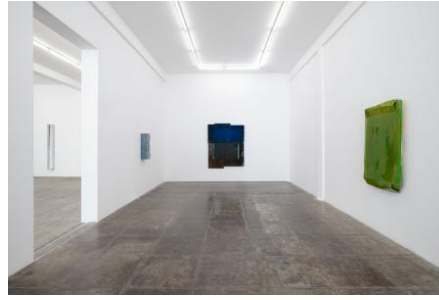
Bijna Niks , 2023