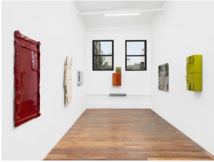
Boxing Glove, 2023