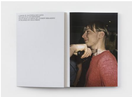
Full of Emptiness , 2021 192 PP / 213 × 297 MM / 400 COPIES / ENGLISH ISBN: 978-1-7345275-6-8, 213 × 297 MM