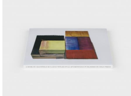
Full of Emptiness , 2021 192 PP / 213 × 297 MM / 400 COPIES / ENGLISH ISBN: 978-1-7345275-6-8, 213 × 297 MM