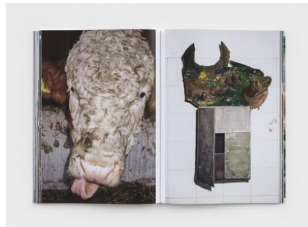
Full of Emptiness , 2021 192 PP / 213 × 297 MM / 400 COPIES / ENGLISH ISBN: 978-1-7345275-6-8, 213 × 297 MM