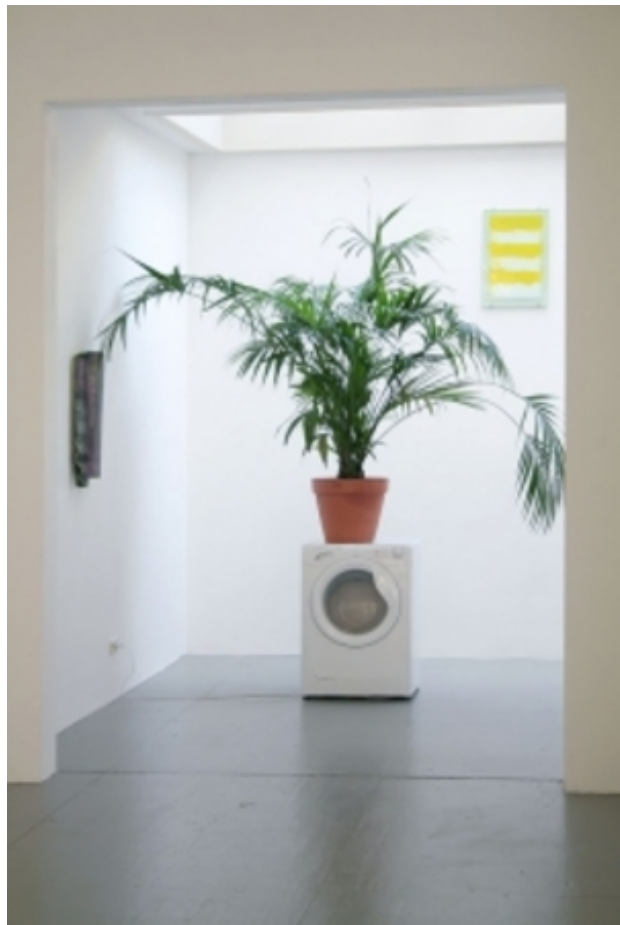
Oh?!, 2014 was machine met plant, variabel