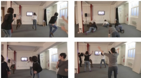
North by Northwest, 2014 Video