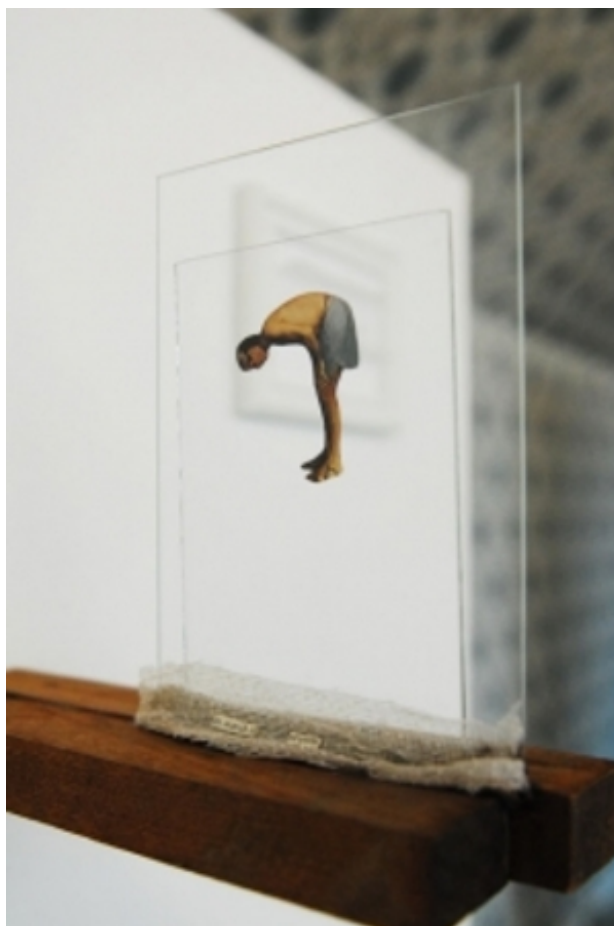
In search of neutral ground, 2017 Mixed media collage