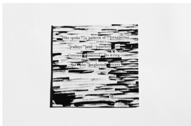
Untitled, 2017 Collage