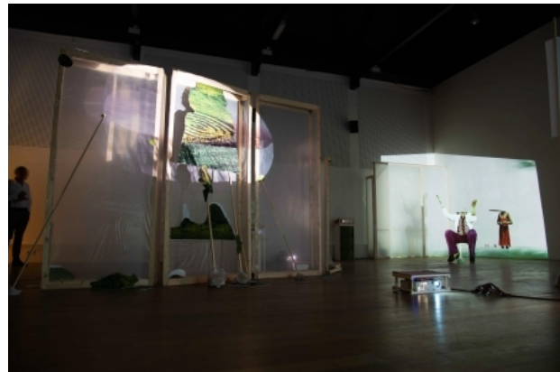
A state of affairs IV , 2018 Mixed-media Installatie