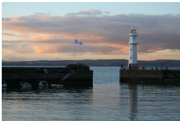
Caller Ou, 2012 Site Specific Flag, N/A