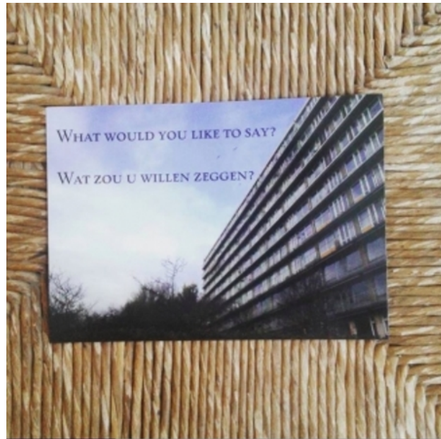
Wat zou u willen zeggen?, 2015 Postcard/community project, N/A