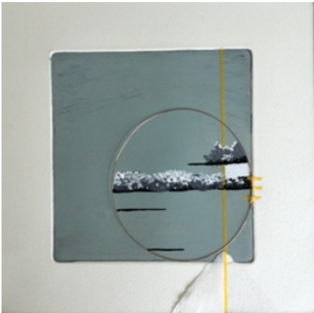
Site revisited 3, 2017 collage, 20x 20

2016 - Saudade - Project Curator. Den Haag. 2018