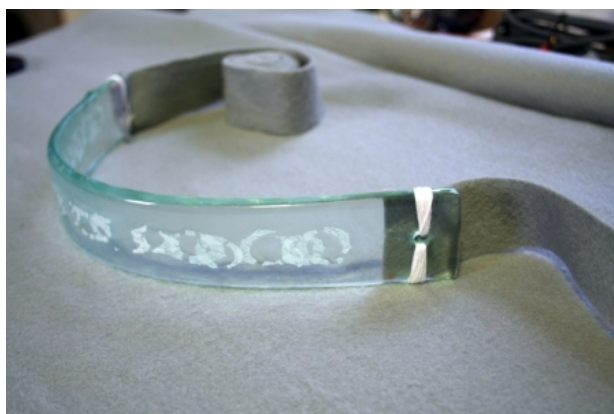
Herring Strap I, 2012 Glass, N/A