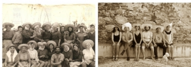
Archivo Ahora Day 21, 2012 Photograph, N/A