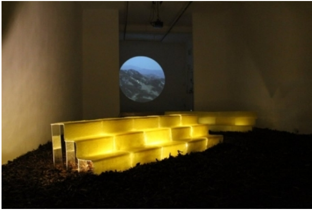
Migrate/Replicate, 2011 Installation, N/A