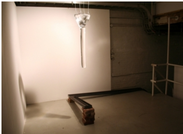
Preservation, 2012 Installation, N/A