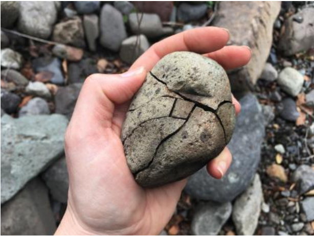
Research 'Black Earth' project, 2022 various media, variable