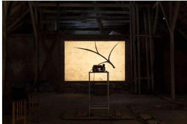
KŌDU / THE REST, 2022 herbal slide installation and slide projection, ca 200x150 cm projection + 100 5x5 cm slides