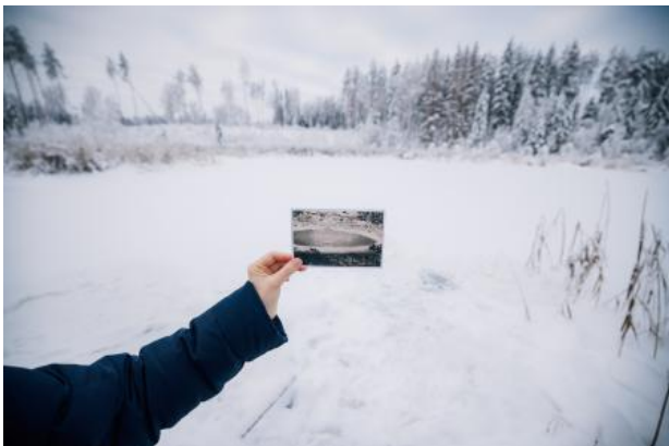
"wa(l)king the meteorite", 2023 video documentation with live voiceover, 8min reading and video