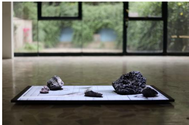
mineral everybody II, 2023 video installation, 70 x 120 x 40 cm; 22min