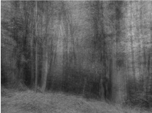
time is an animal, 2024 digital image, work-in-progress

2015 The Cultural Endowment of Estonia Tallinn, Estland123 study grant