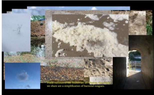
every second is kissed by billions of lips (love letter to 'dierkens'), 2023 video; 7,5min, projected on 200x112,5cm screen