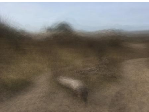
half-hidden, moss-driven, cloud-like, 2021 series of six digital photographs and field notes, shown online