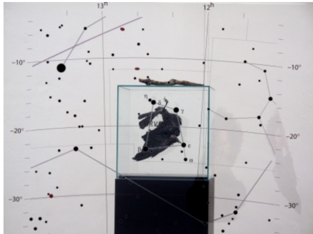
Why is the crow like a writing desk, 2013 installation, variable