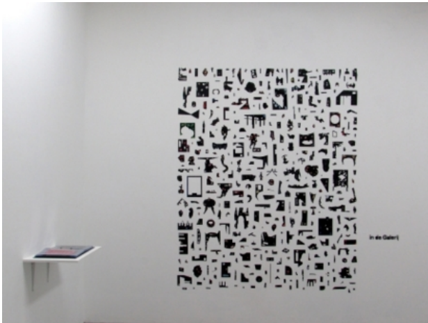
in de Galerij, 2015 installation, variable

2006 FIAP Selector Ribbon 144th Edinburgh International Exhibition of Photography (UK)