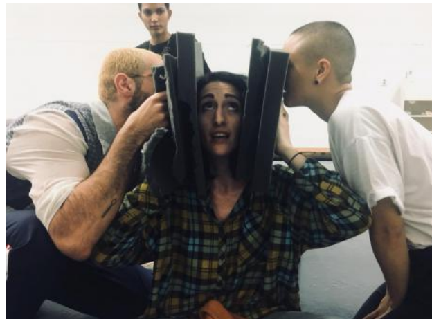
BodyScores, 2018 Workshop