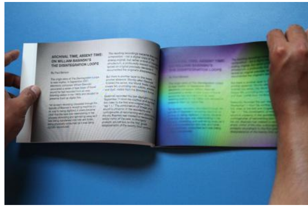
Looking at You Looking at Me, 2021 publicatie, A5