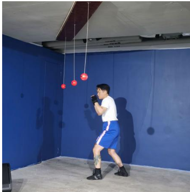
Proximity Drill, 2023 Sound, electronics, performance