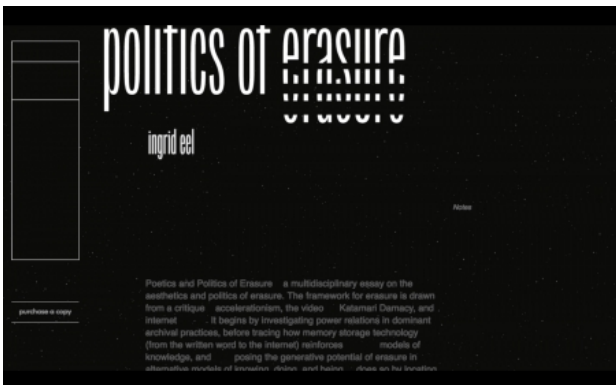
Poetics and Politics of Erasure, 2017 Digital publication