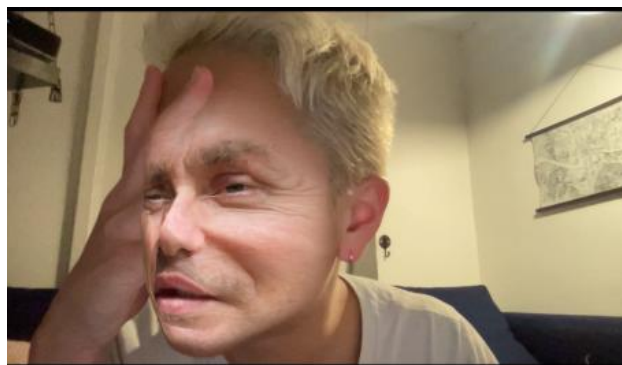
Reframing the Face , 2021 Workshop, 2 uren