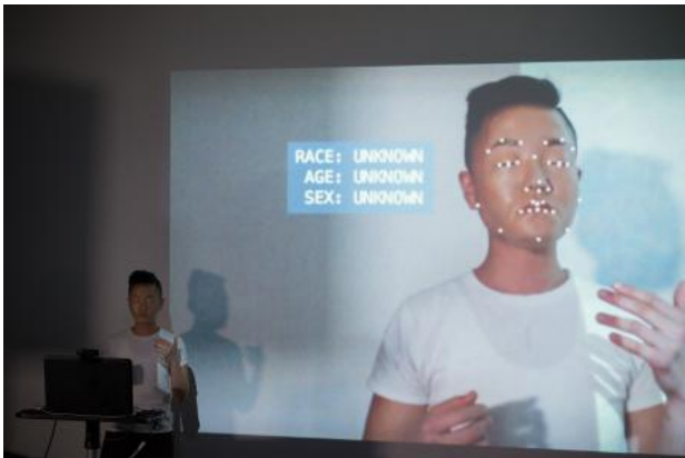
On Illegibility, 2018 Lecture-Performance, video, gezichtsherkenning app, 15 minuten