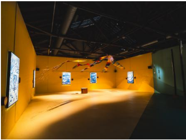
Glitch in The Weave, 2024 woven textiles, conductive thread, digital printed textiles, sound