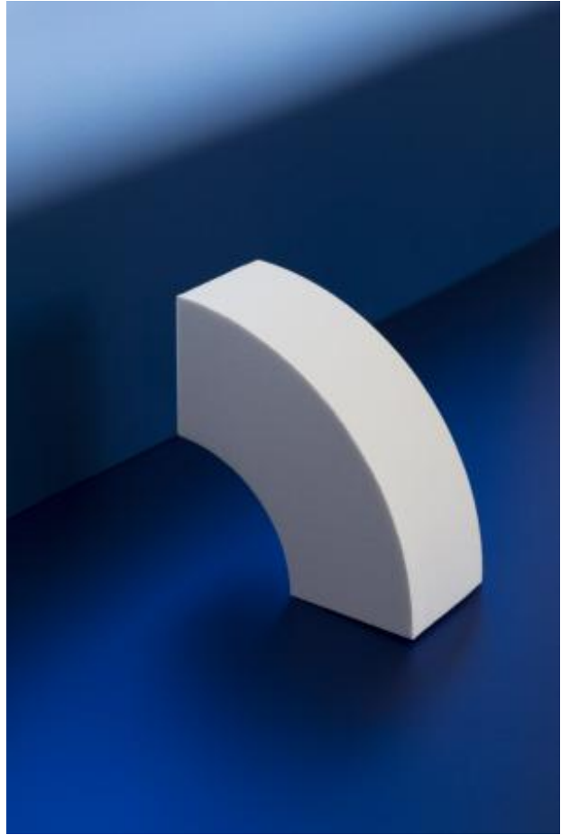
Form from, 2021