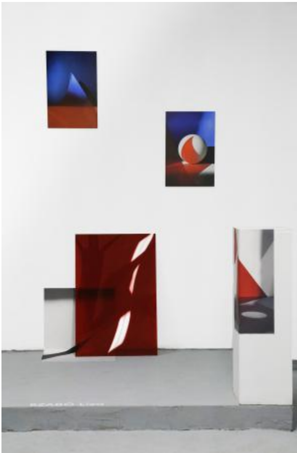
Form from, 2020 Various