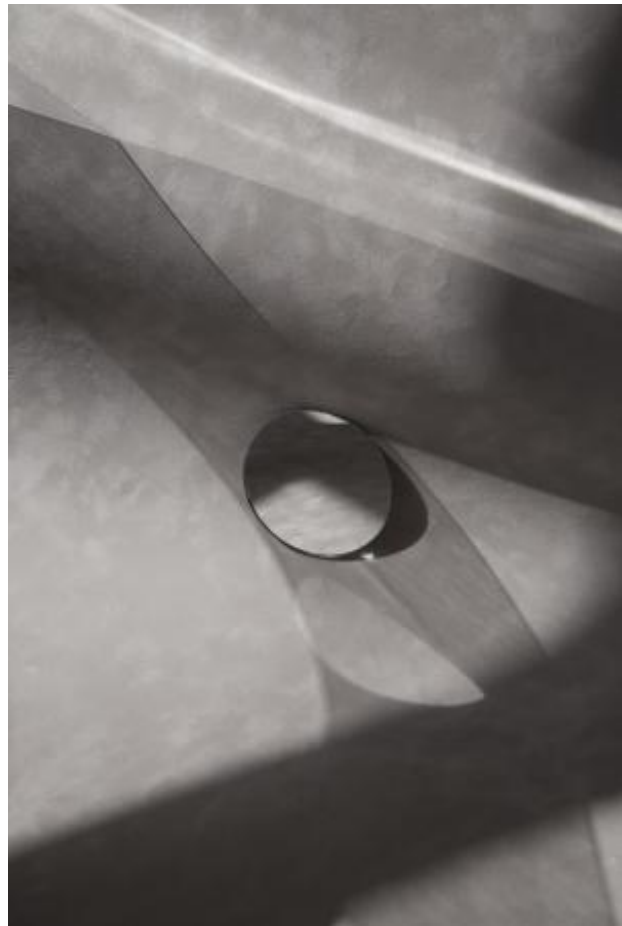
Circle shadow, 2020