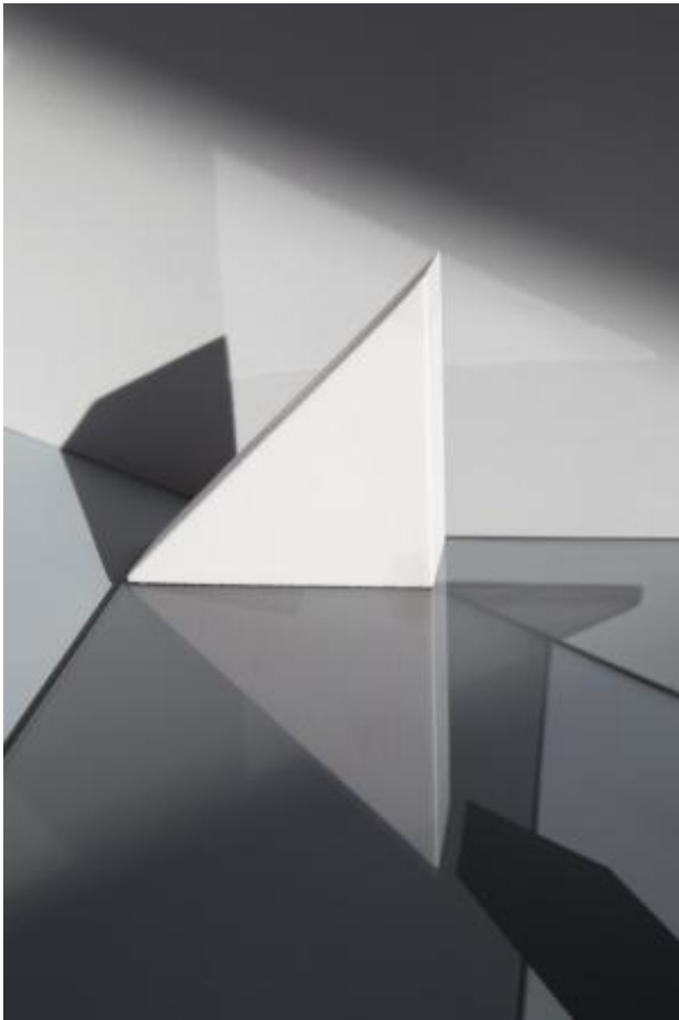
Circle shadow, 2020