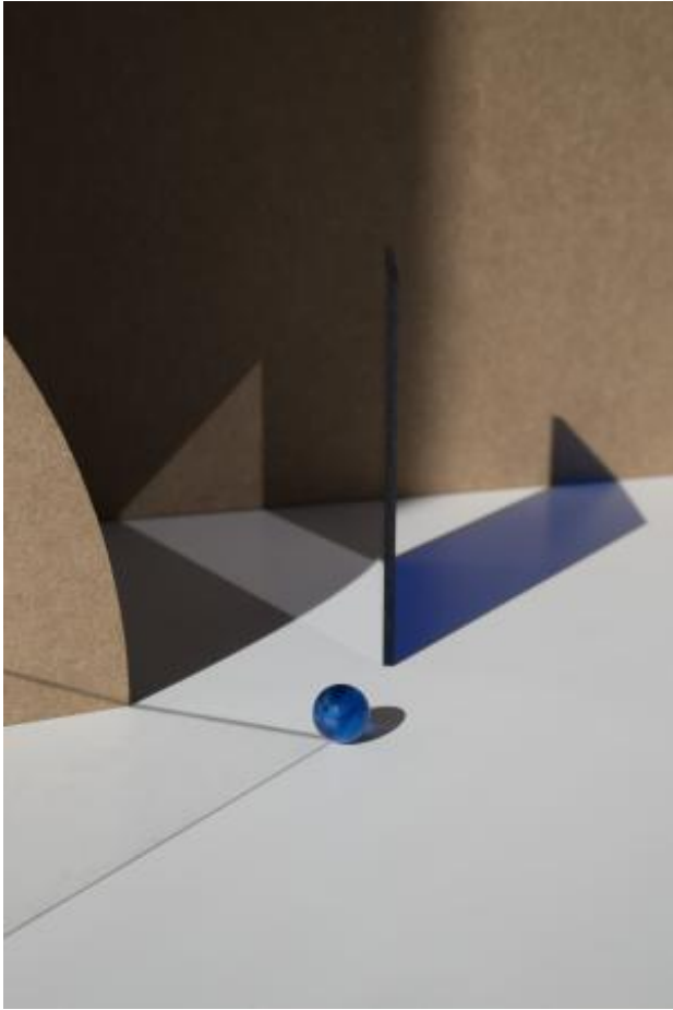
Form from, 2021