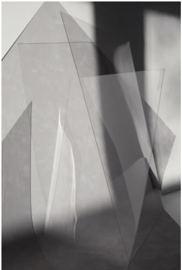
Circle shadow, 2019