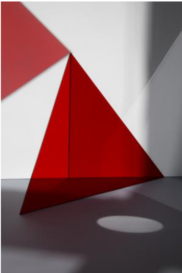
Form from, 2020