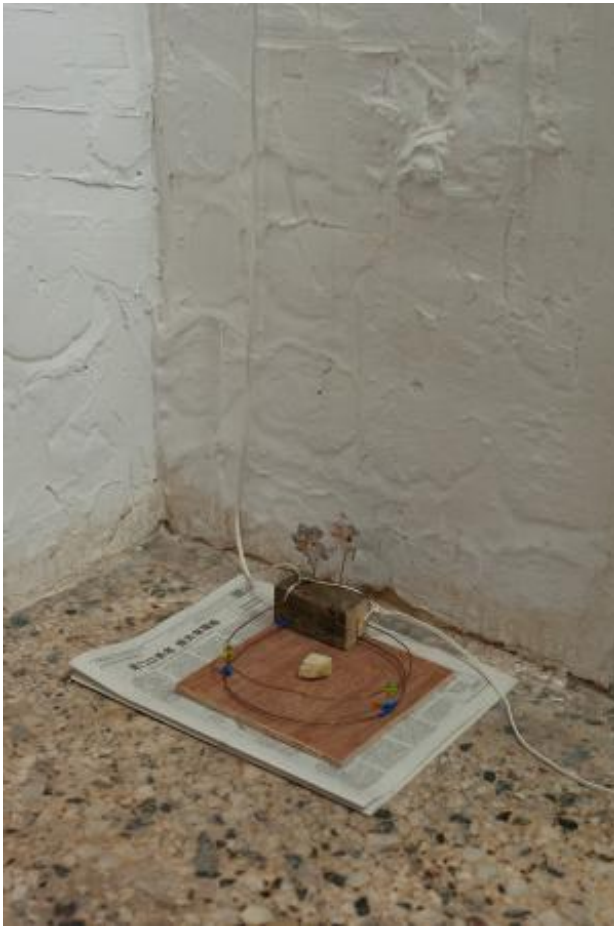
Mouse Trap, 2019 Sculpture