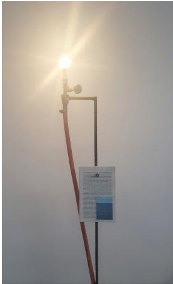
Memento 1, 2019 sculpture