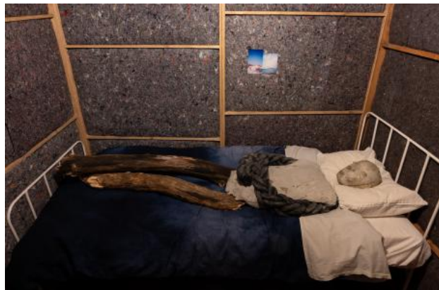
For Insomnia, 2020 sculpture