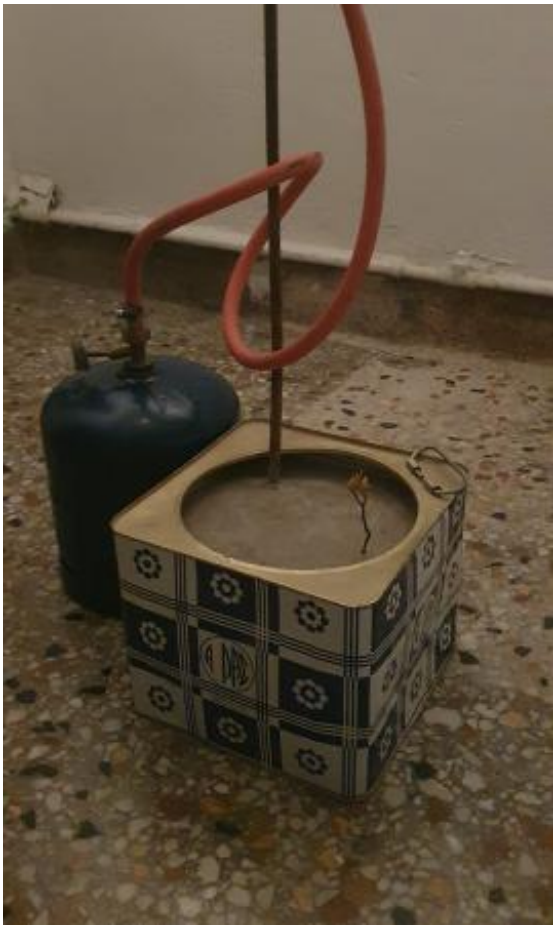
Memento 1, 2019