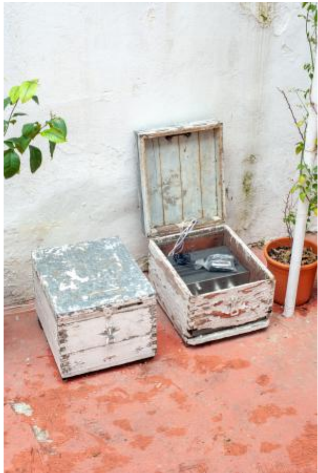
For Bees, 2019 sculpture