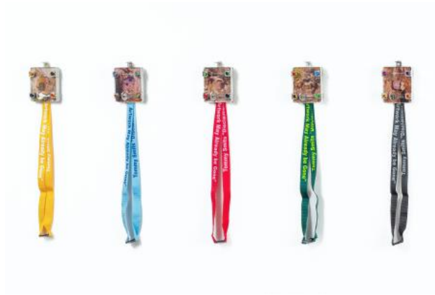
Disclaimer: Artwork May Already be Gone, 2024 Key, plexiglass, Lasercut Metal, Hahnemuhle baryt print, rivets, lanyard, 40x100