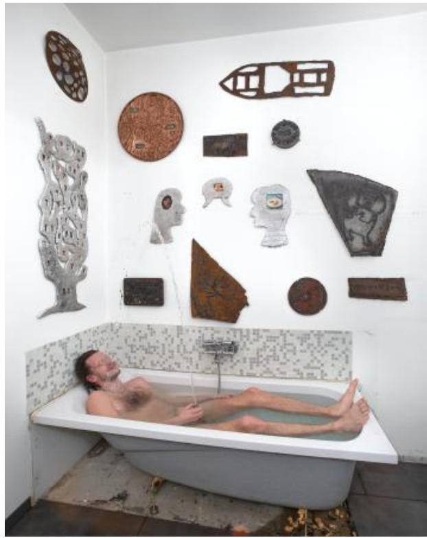
Ik hoor wat je zegt, 2024 Plasma Cut Metal, Casted Aluminium, Bathtub, 300x300