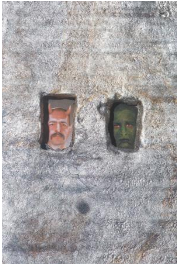
family tree, 2024