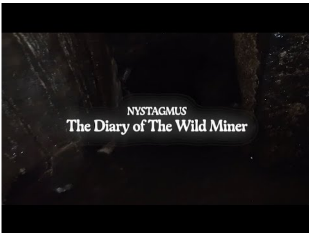
Nystagmus: diary of the wild miner, 2023 12