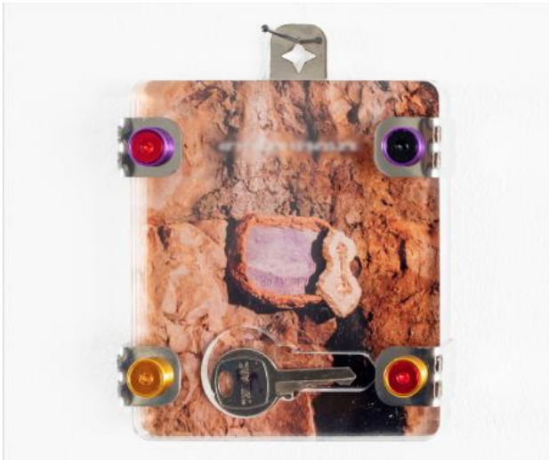
Disclaimer: Artwork May Already be Gone, 2024 Key, plexiglass, Lasercut Metal, Hahnemuhle baryt print, rivets, 10x9