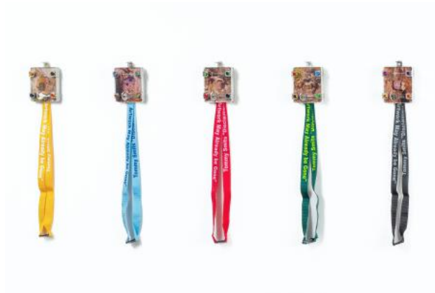
Disclaimer: Artwork May Already be Gone, 2024 Key, plexiglass, Lasercut Metal, Hahnemuhle baryt print, rivets, lanyard, 40x100