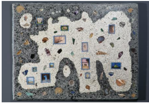
The Secret map of the hidden area, 2023 marle, c-prints, led strip, epoxy, gemstones, fossils, 100x80