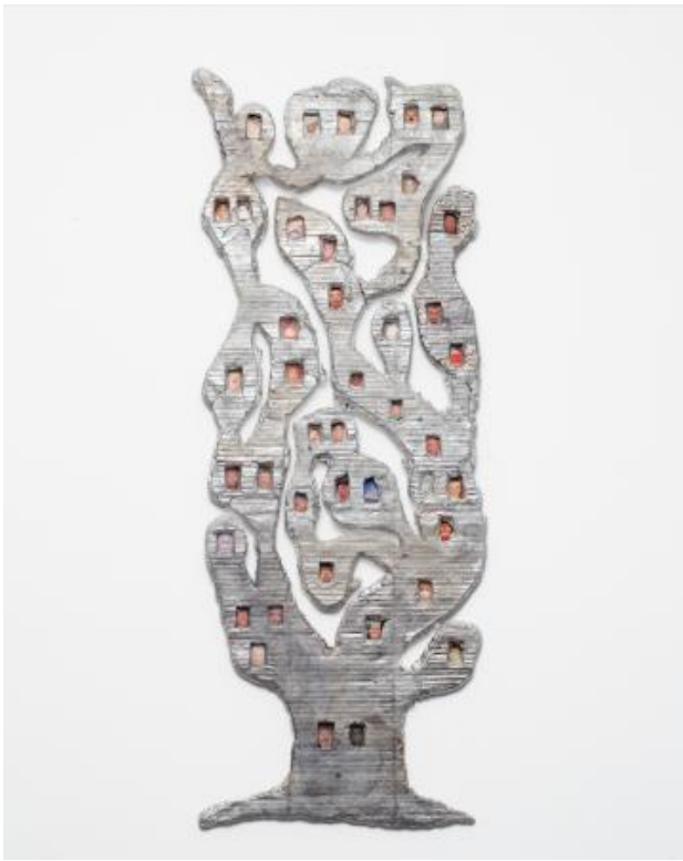
Family Tree, 2024 cast aluminium, found photography, 80x50