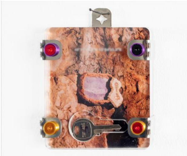
Disclaimer: Artwork May Already be Gone, 2024 Key, plexiglass, Lasercut Metal, Hahnemuhle baryt print, rivets, lanyard, 10x9