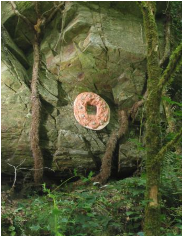
New Solo Just Dropped 1, 2023 Plaster, Concrete, c-print, 70x70