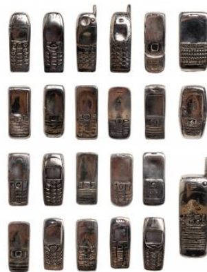
Nokia Collection, 2021 Aluminum (remelted from old Amsterdam metro line), Variable