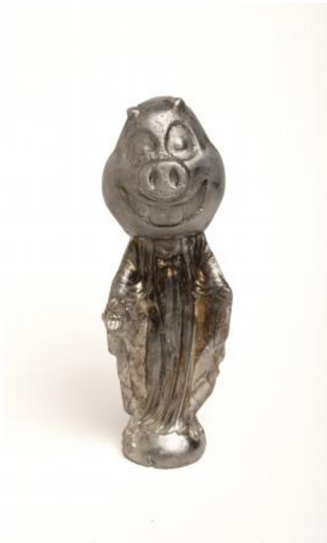
Santa Scrofa, 2021 Aluminum cast, 6x5x12