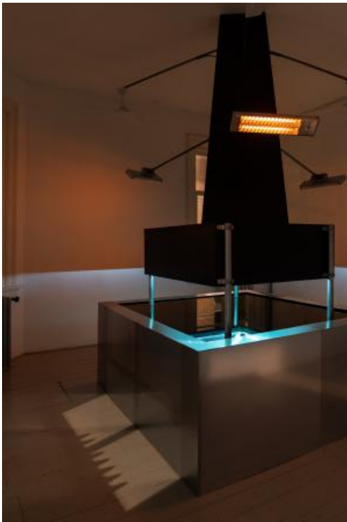
Burning Door Handle, 2022 Installation