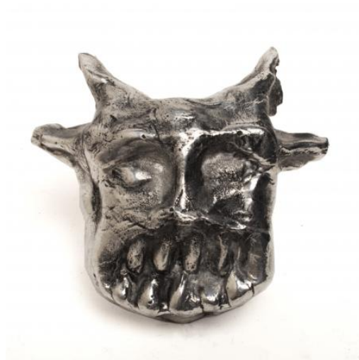
El Diablo, 2021 Aluminium Cast, 10x10x5