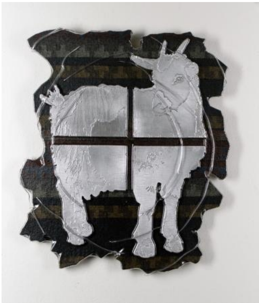
Delimidi, 2023 Aluminium cast, textile, PET G, 40x35x2