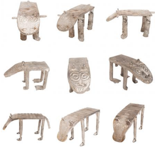
Jungle farm, 2021 Aluminum Casts, Variable