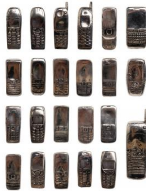
Nokia Collection, 2021 Aluminum (remelted from old Amsterdam metro line), Variable