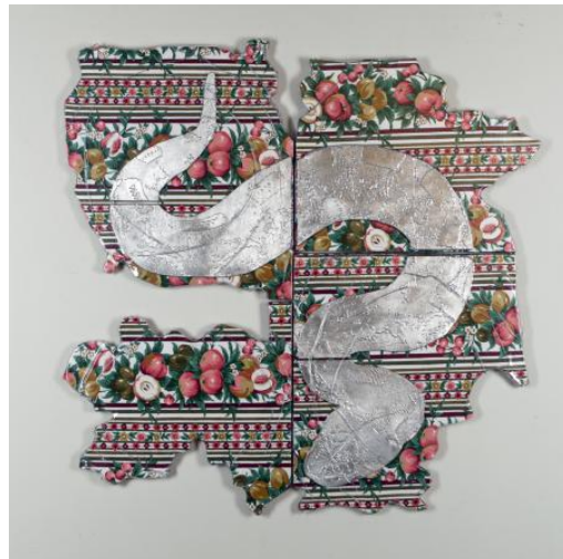
Masuri, 2023 Aluminium cast, textile, PET G, 1x1x0.06m