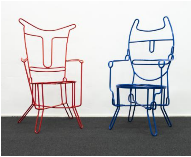
Spyros's Chairs, 2022 Powder coated hand-bend steel rods