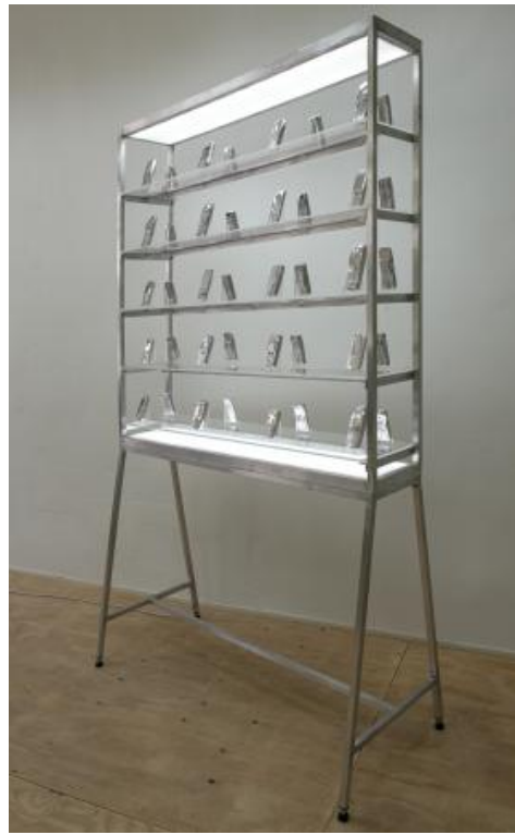
Fast Lane, 2022