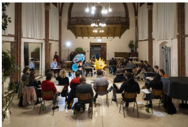
The North Wind and the Sun, 2023 paper mache, fabric, n/a