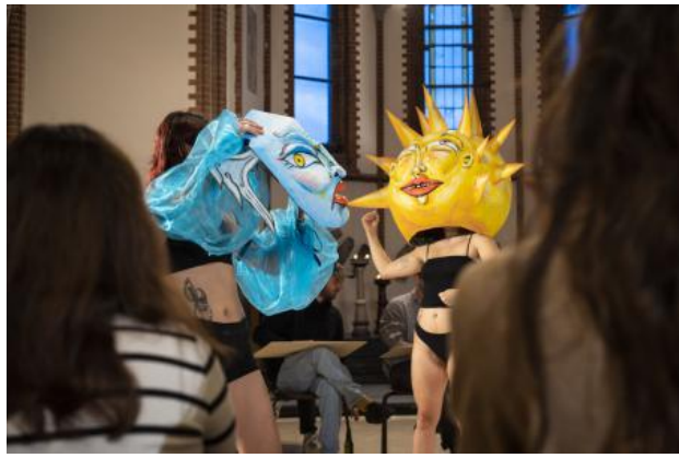
The North Wind and the Sun, 2023 paper mache, fabric, n/a