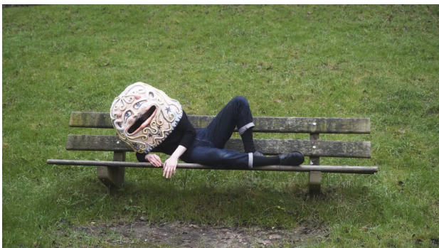
A Blot on the Landscape, 2022, 2022 1 minute