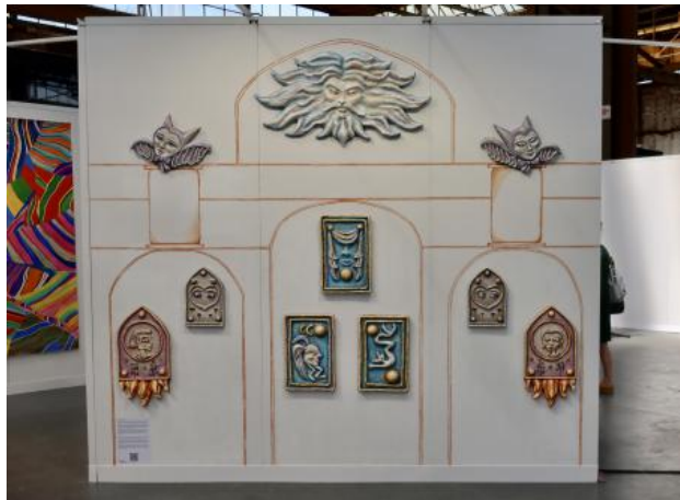
Temp. Temple, 2023