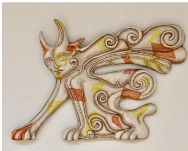
Stared Too Long, 2024 paper mache, paint, 60x75x6cm

Ongoing Entertainment Project (Bouquet), 2024