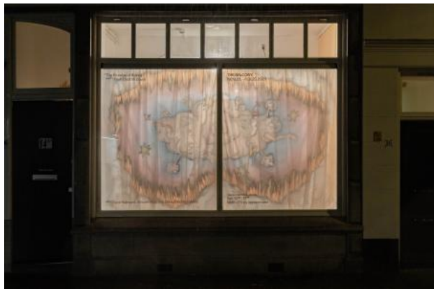
The Heavenly Fight Cloud, 2022