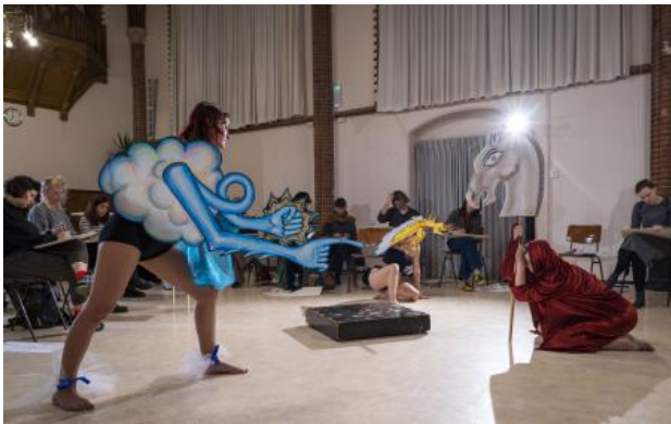
The North Wind and the Sun, 2023 paper mache, fabric, n/a