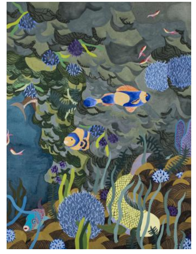
Arrogant Clown, 2022 acrylic paint and fabric dyes on unbleached cotton, 80\,\mathrm{x} 60\,\mathrm{c}