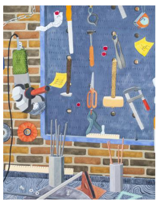
Tools for Agg, 2022 acrylic paint and fabric dyes on unbleached cotton, 90 \times 70