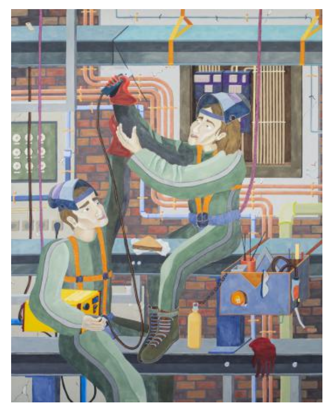
Agg and Erik, fixing things, 2022 acrylic paint and fabric dyes on unbleached cotton, 190 x 150\,