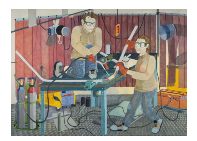
Acetelyne Bending, 2022 acrylic paint and fabric dyes on unbleached cotton, 250 x 180\,