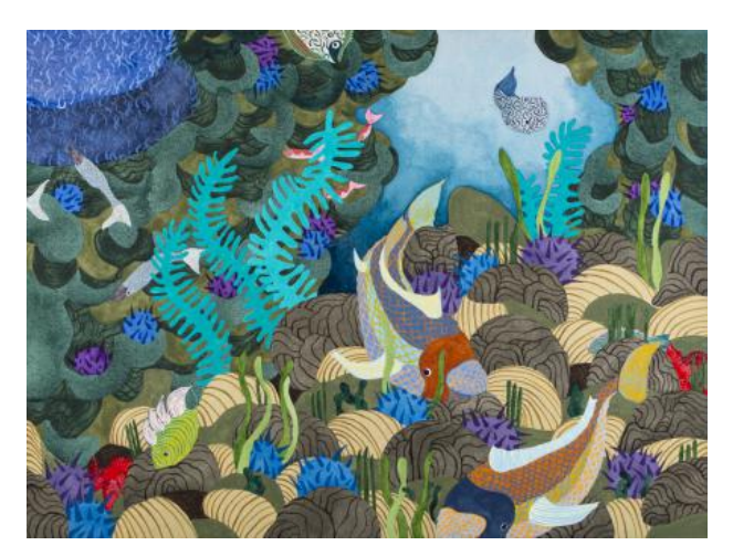
Lousy Carp, 2022 acrylic paint and fabric dyes on unbleached cotton, 60\,\mathrm{x} 80\,\mathrm{c}