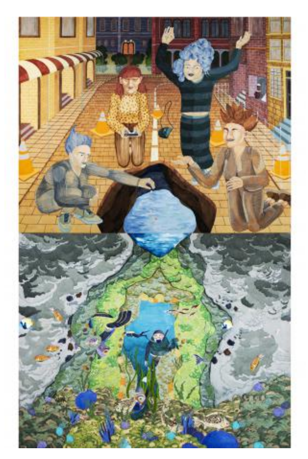
City Sinkhole, Sea Sinkhole, 2022 acrylic paint and fabric dyes on unbleached cotton, two Paintings, each 190 \times 150

Under the Ginkgo, 2022 acrylic paint and fabric dyes on unbleached cotton, 250 x 180\,