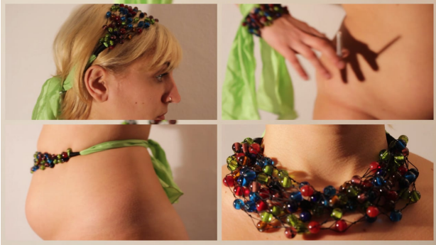
ornamento- tribute to my sister, 2019 00:08:45