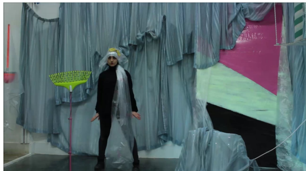
Filmato x vimeo2, 2017 00:00:49