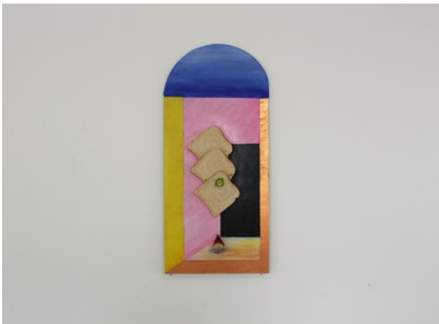
The Holy bread, 2016 Acrylic paint on wooden panel, bread slices, tea bag., 65CMX30CM4