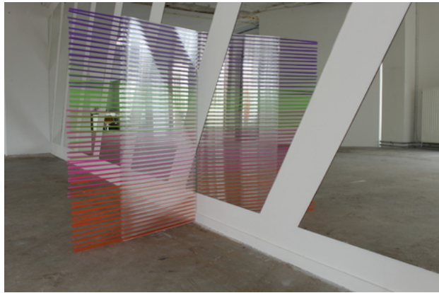
Formal study, 2019 Plexiglas, plastic straw, mirror, varied sizes