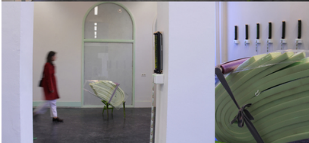
Unfunctional green, 2018 Installation: mixed media, varied