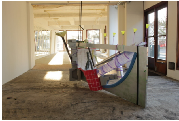
The ark, 2019 mixed media, varied sizes