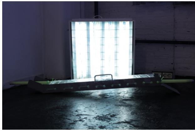
Self reflection, 2018 light box, light tube, scrub metal. Mixed media, varied sizes.

XENO NATURA MORTA 2019, 2019 Installation, plastic straws, mixed materials, varied size.