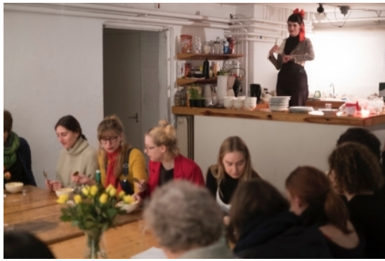
To the Left, 2018 performance