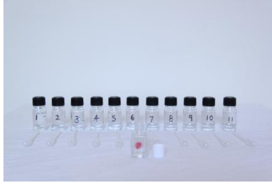
iii Sensory Kit #2 - ArtScience Body, 2021 Experimental Perfume Kit