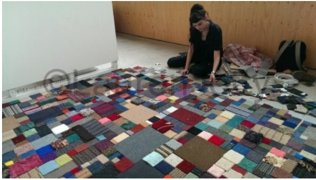
683 Samples, 2014 installation with carpet samples