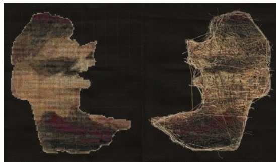
Apocalypse, 2017 hand sewn cross stitch on aida cloth, ro, 30 x 32.5 cm incl. frame