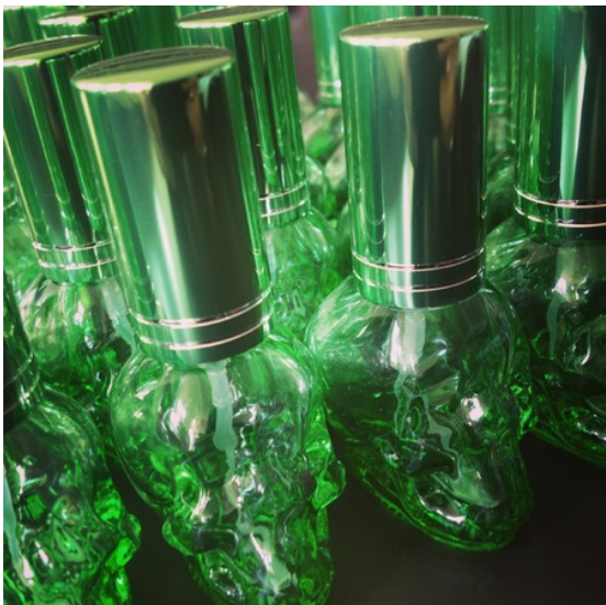
ArtScience Perfume, 2018