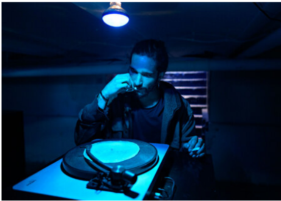
Notes #2, 2018 performance: 3-part storm accord and 3-part vocal accord cast into ice records