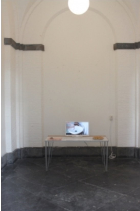
Nutty Wash, 2018 installation