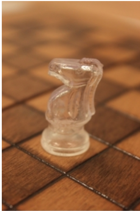
Smelly (K)Night #2, 2018 cedar wood infused UV curing resin, 3D p, h5