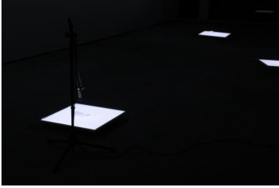
Do Not Touch // Ice Radio, 2021 Ice, Microphones, Speakers, LED Panels , Installation