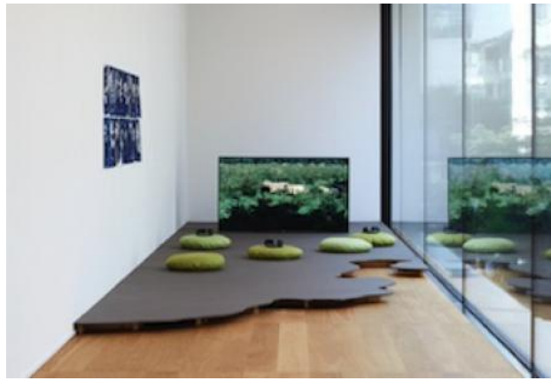
Plant Human, 2022