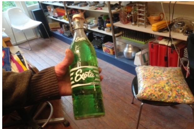
The (In)Visible Vintage Shop, 2018