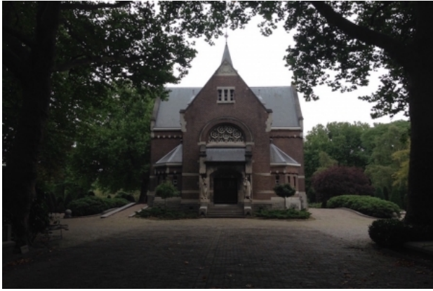
The Unknown Person's Funeral, 2018