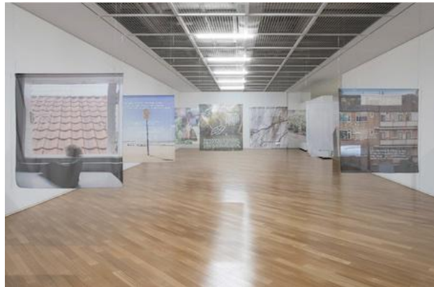
Soothing Songs from an Alien, 2021