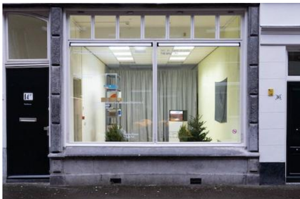
The Christmas Trees Project2, 2022