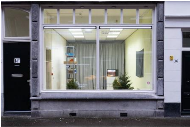
The Christmas Trees Project2, 2022