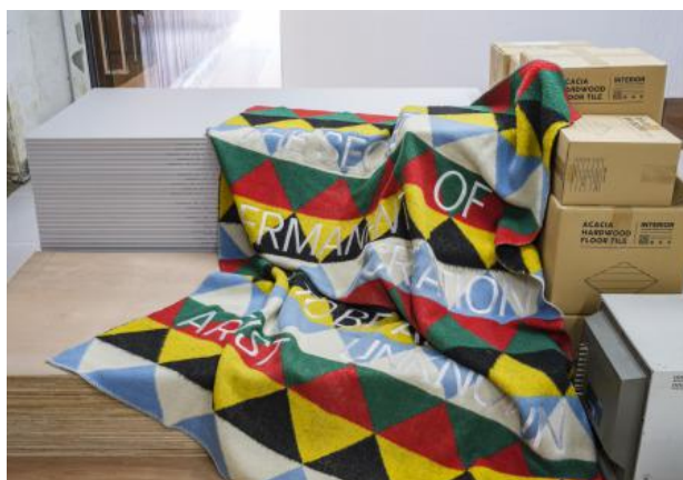
Blanket Resistance, 2023