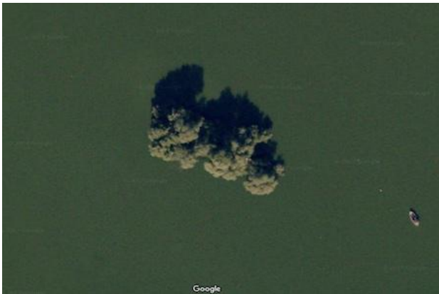
The Christmas Trees Project 1: The Christmas Trees Island, 2020