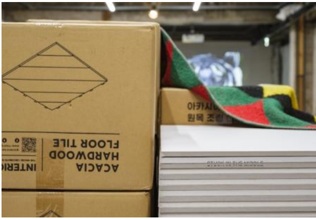
Stuck in the Middle, 2023