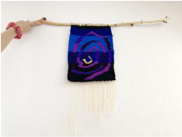
january, 2022 weaved cotton and wool