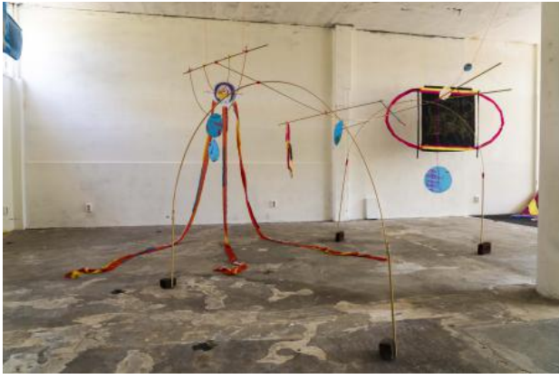
Installation shot of show at Lab23, 2023