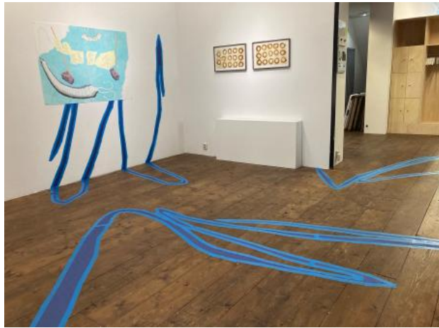
The myth of the silverfish pt. 1, 2022 Drawing, print, publication, animation, and spatial installation, variable