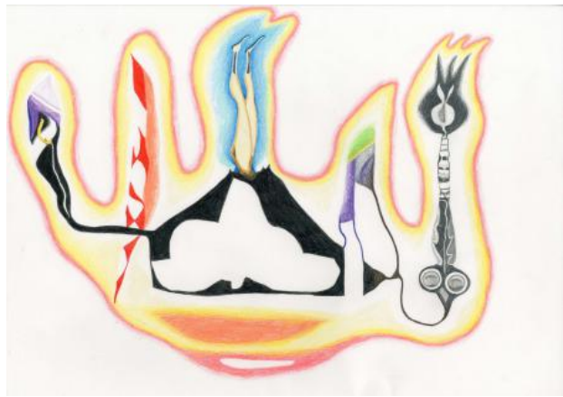
hand, 2023 pencil on paper