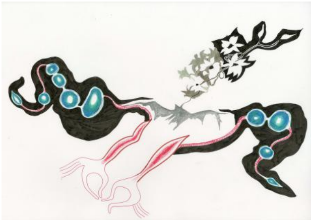
hands, 2023 pencil and marker on paper