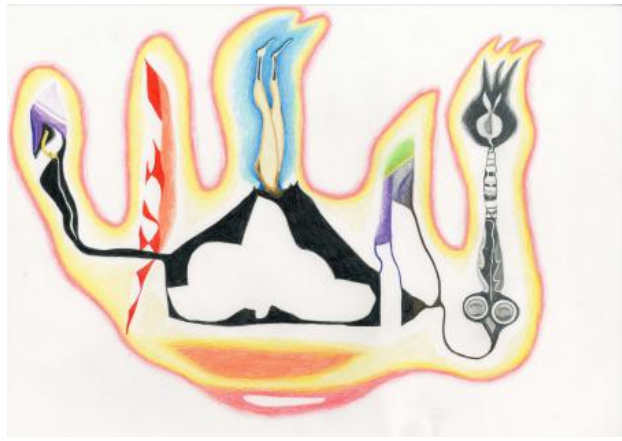
hand, 2023 pencil on paper