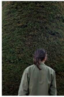
Untitled, 2016 Digital C print, 40x60