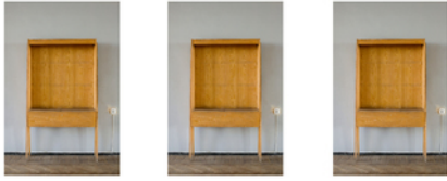
where is everybody, 2018 Digital C-Print, 70x45cm