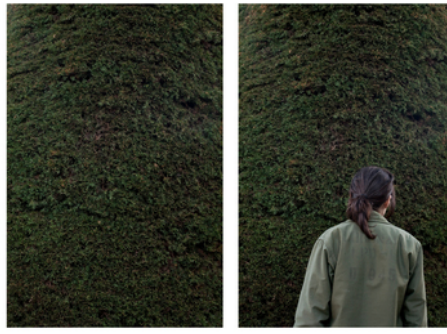
Untitled, 2016 Digital C print, 40x60