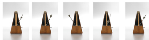
green ray, 2017 digital c print, 70x54