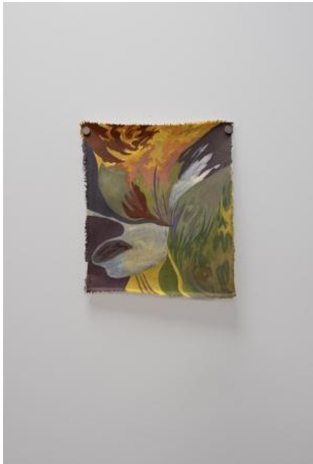
Reading Slippages (a small painting series), 2024 Gouache on canvas