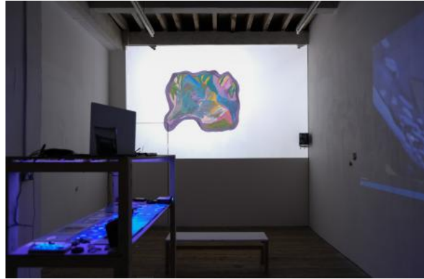
Reading Slippages, Writing Interstices, 2023