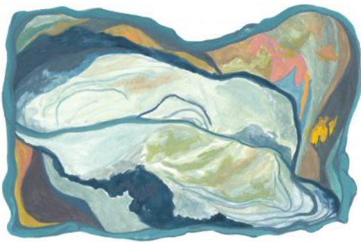
Reading Slippages, 2023 Watercolour on paper