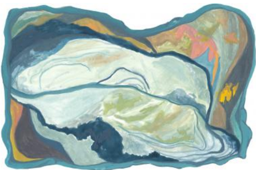
Reading Slippages, 2023 Watercolour on paper