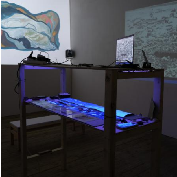
Reading Slippages, Writing Interstices, 2023