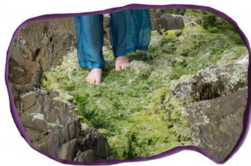
Reading Slippages, 2024 Animation Still