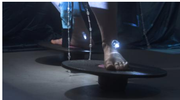
Pulp of the Sea (performance), 2021 Film