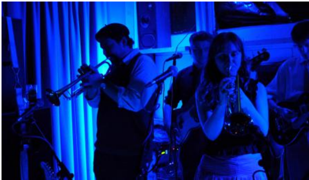
Reading Slippages (Live), 2024 Performance

2021 Stroom Pro Invest (sinds 2004) Stroom, Den Haag Den Haag, Nederland