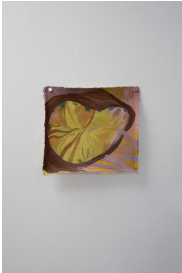
Reading Slippages (a small painting series), 2024 Gouache on canvas