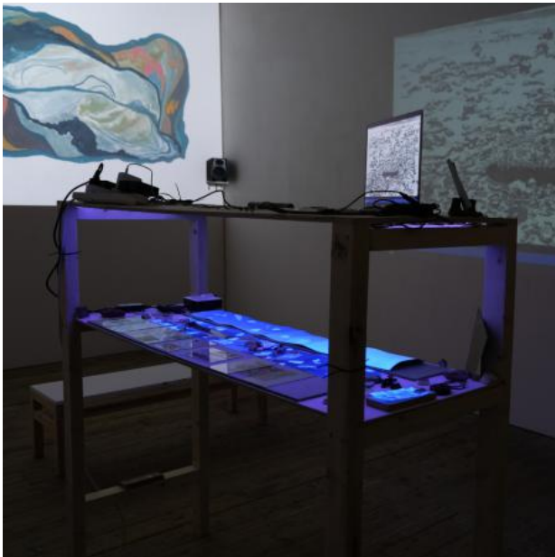
Reading Slippages, Writing Interstices, 2023