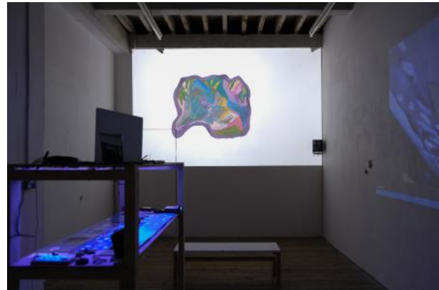
Reading Slippages, Writing Interstices, 2023