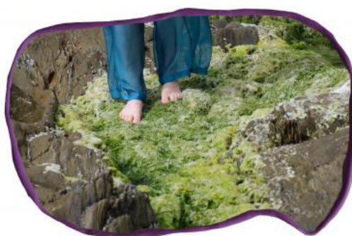
Reading Slippages, 2024 Animation Still