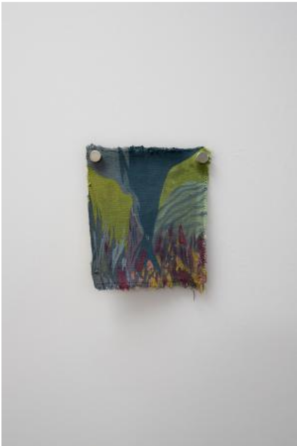
Reading Slippages (a small painting series), 2024 Gouache on canvas