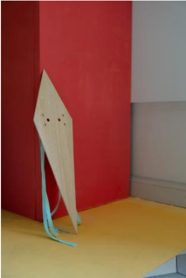
Lose Voice Toolkit, 2024 18'30", super 16mm transferred in 2K, projection, film set, props, costumes,, variable dimensions