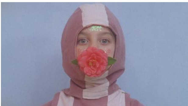
Lose Voice Toolkit (video still), 2024 super 16mm transferred in 2K, , 18'30"