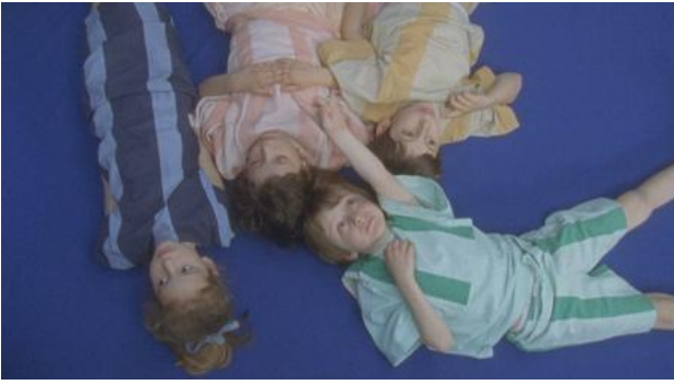
Lose Voice Toolkit (video still), 2024 super 16mm transferred in 2K, 18'30"