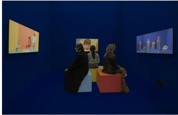
Lose Voice Toolkit, 2024 three channel installation, 5'30", 6'00", 5'15", super 16mm transferred in 2K, 350x350x400cm