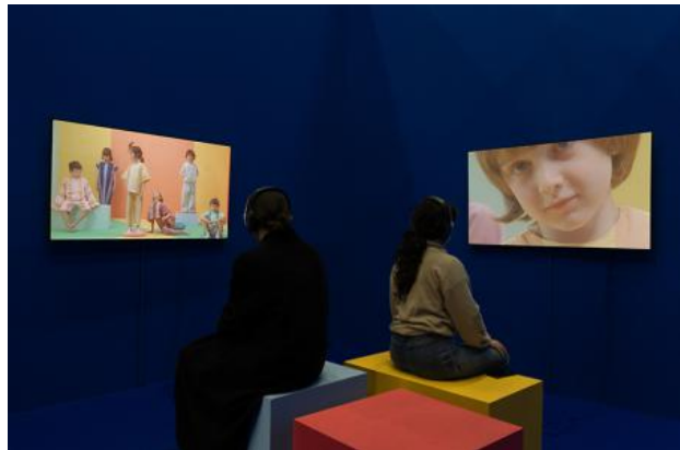
Lose Voice Toolkit, 2024 three channel installation, 5'30", 6'00", 5'15", super 16mm transferred in 2K, 350x350x400cm