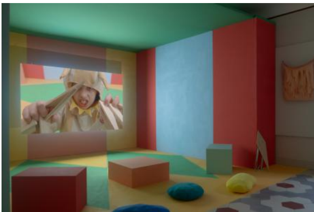
Lose Voice Toolkit, 2024 18'30", super 16mm transferred in 2K, projection, film set, props, costumes,, variable dimensions