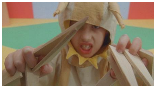
Lose Voice Toolkit (video still), 2024 super 16mm transferred in 2K, , 18'30"