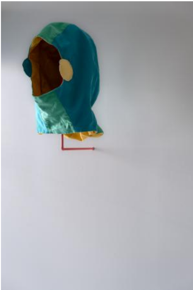
Lose Voice Toolkit, 2024 18'30", super 16mm transferred in 2K, projection, film set, props, costumes,, variable dimensions