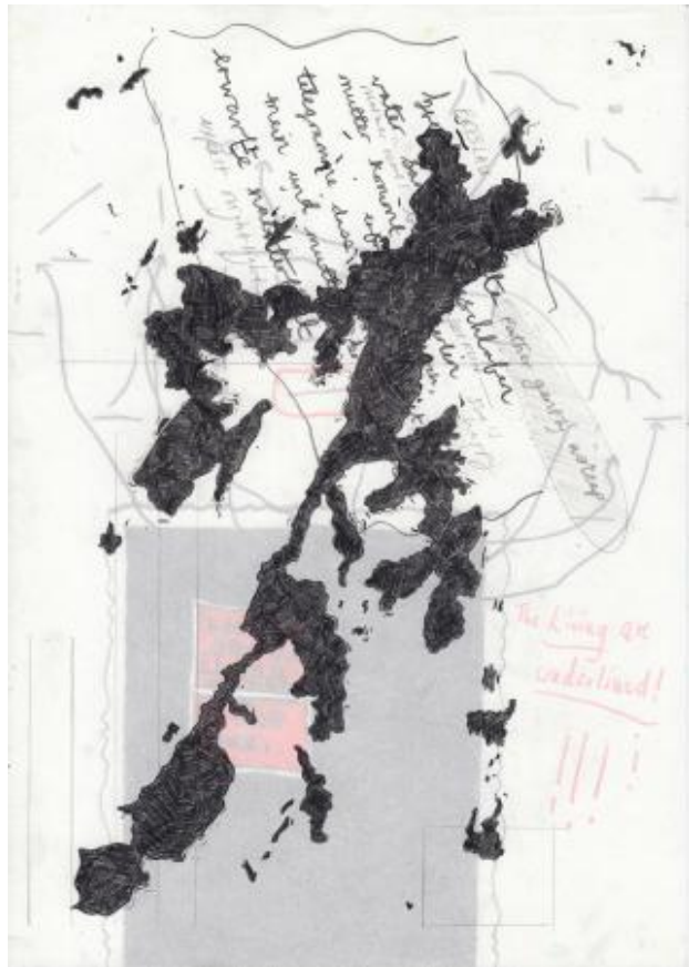
Father Gently Asleep (from the series Little Odes), 2023 Pencil on transparent paper, 210 x 297mm