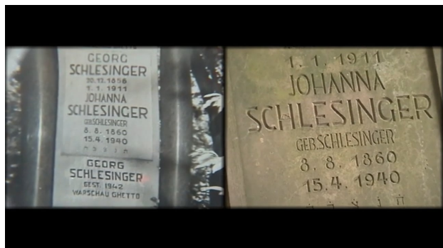
I've to Think Not Twice, but Twice Twice, 2022 3 minutes