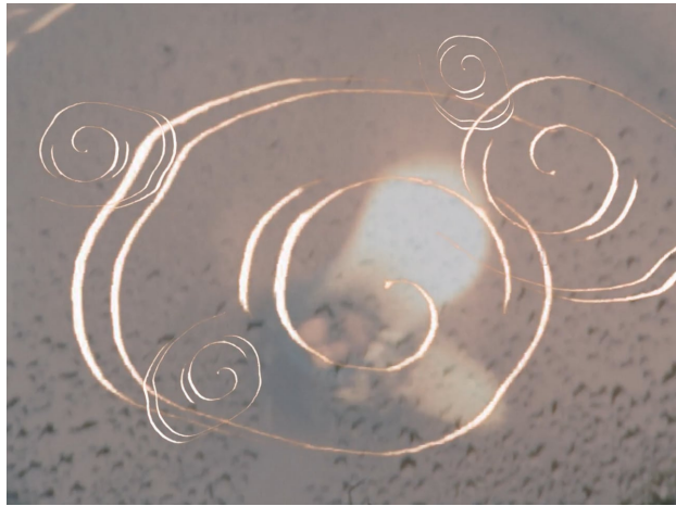
Inherited Pains (sketch for my gasping stomach), 2022 1 minute