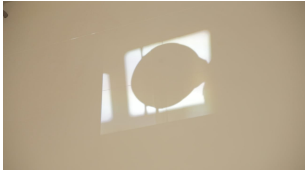
Moonbeams; to negotiate a better arrangement, 2020

The Butterfly Dream, 2021 digital video & MiniDV, 640 x 960 pixels