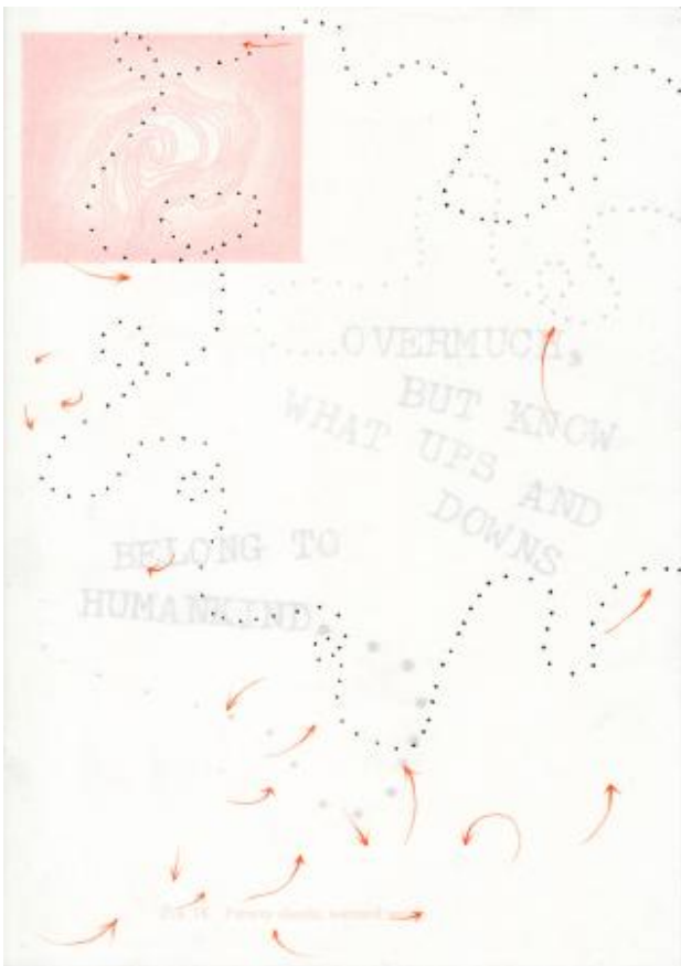
Undigested Shocks (from the series Little Odes), 2023 Pencil on transparent paper, 210 x 297mm