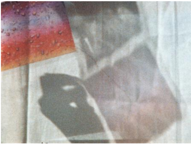
Heavenly and Harrowing, 2024 Super 8mm transferred to HD