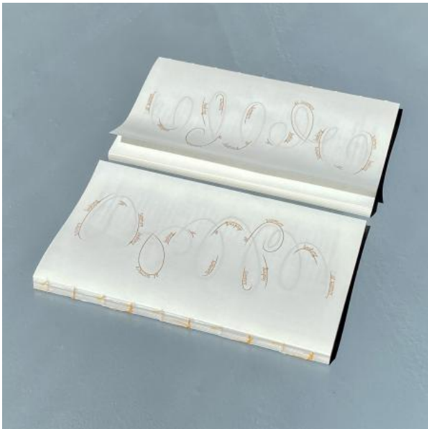
Women Looking at Women Looking at Women, 2022