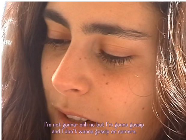
Where the voices go, hectic with sun, 2020 3 minutes