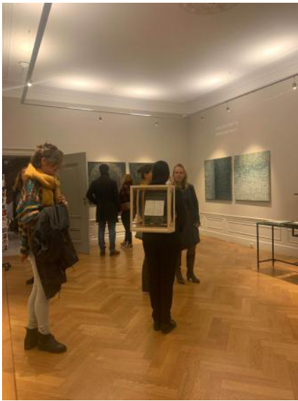
Performance Museum Night The Hague, 2021 Performance, Variable