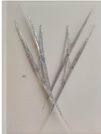
Installation at Exhibition The Roaring 20's, 2021 Sculpture. , 250cm x 150cm x 20cm