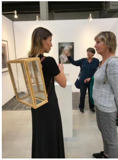
Performance Partially Conceivable, 2021 Performance/Sculptures, Variable