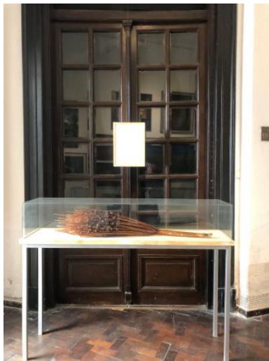
S/T , 2021 Sculpture and writing., 180cm x 150cm x50cm