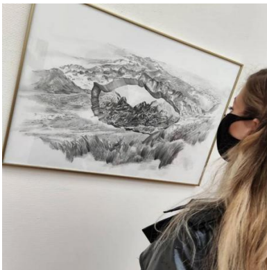
Exhibition new members Pulchri., 2021 Drawing. Graphite on paper., 80cm x 110cm