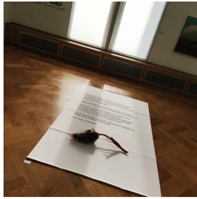
Installation BRUJA at Spring Saloon, 2021 Writing and sculpture., 20cm x 150cm x 200 xmm