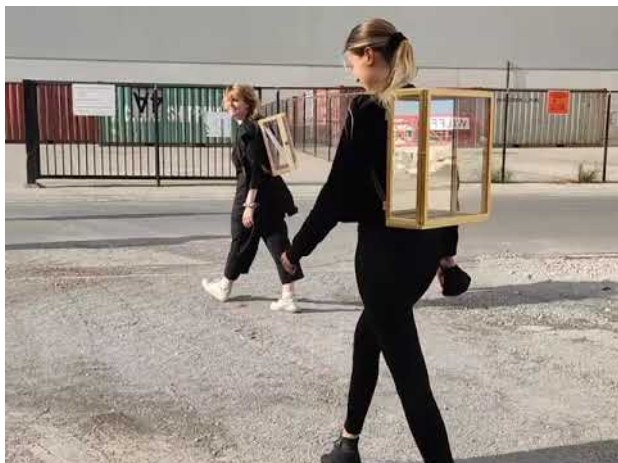
KONVOOI FESTIVAL - BRUGGE BELGIUM, 2021

2019 - 2019 Working as a guide at the Museum Voorlinden Loopt nog