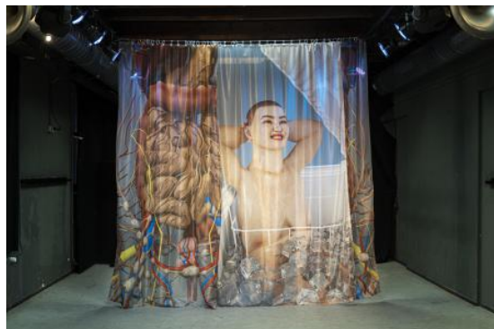
Ice Bath, 2021 Digital print on polyester, 535 x 350 cm