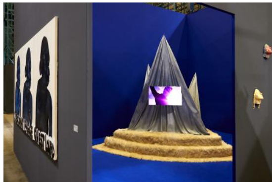
You are light and cabbage, 2023 video sculpture, 300 cm x 250 cm x 250 cm