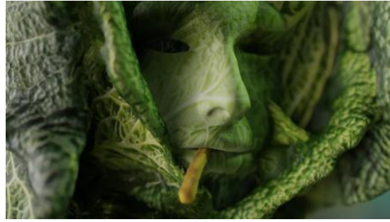
You are light and cabbage, 2023 video still