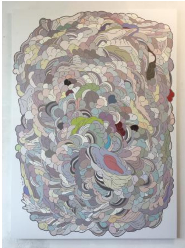
Anaphase1, 2022 drawing, digital print on PVC, 170 x 125 cm