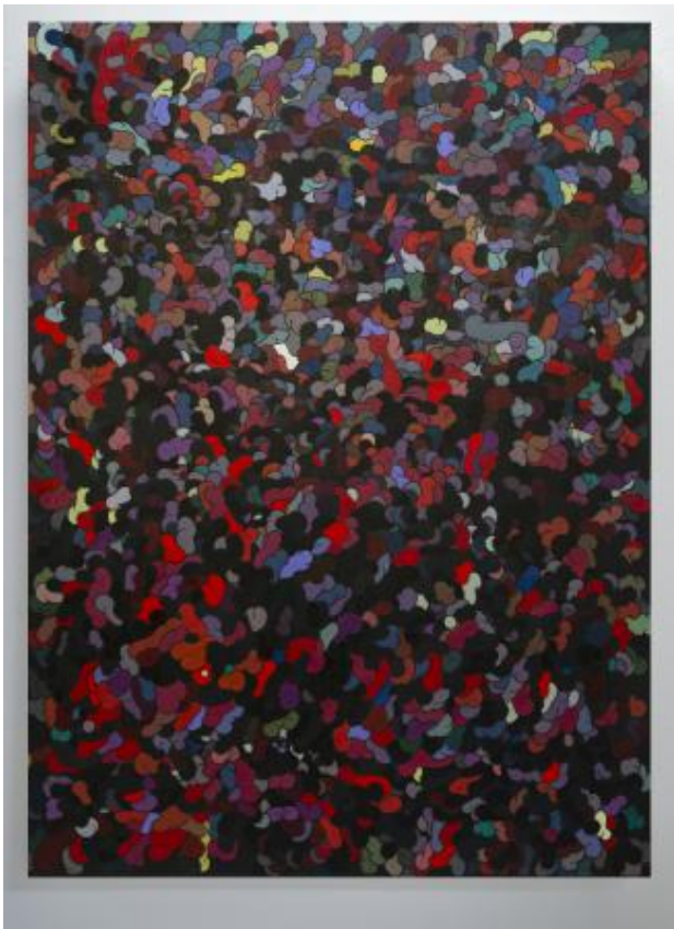
An entrance to, vol.2 , 2023 Acrylic on canvas, 200 x 145 x 5 cm