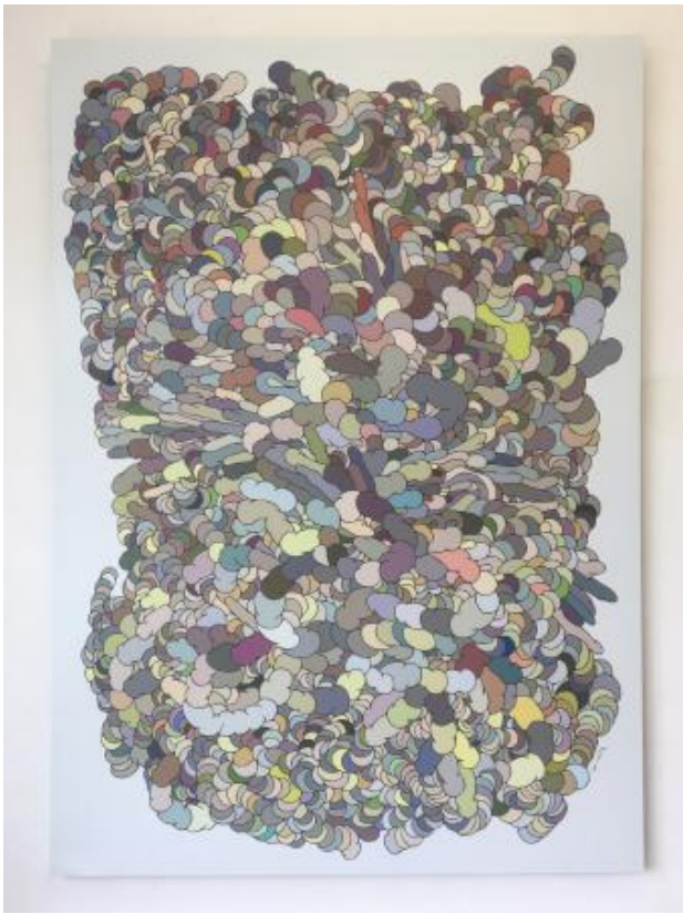
Anaphase 2, 2022 drawing, digital print on alminuim, 170 x 125 cm