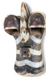
the Mask: True, I have raped history, but it has produced some beautiful offspring, 2021 African mask(replica) covered with the diamonds(replica), 30 x 19 x 19cm