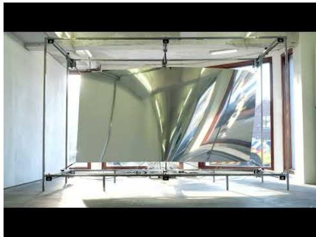
Warped, 2022 10min