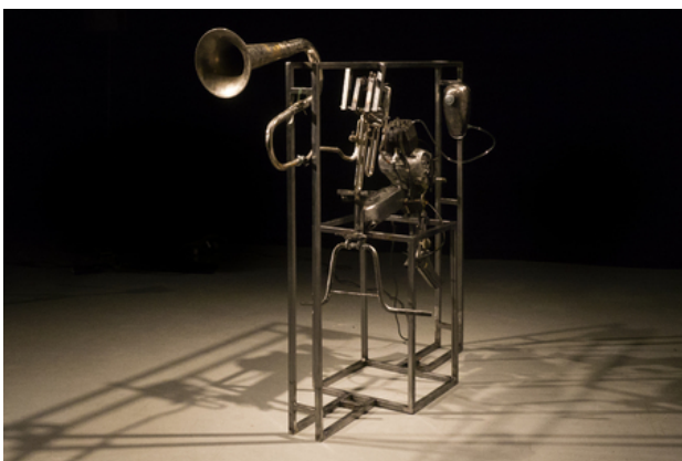
The Last Song of a Two Stroke Engine, 2020