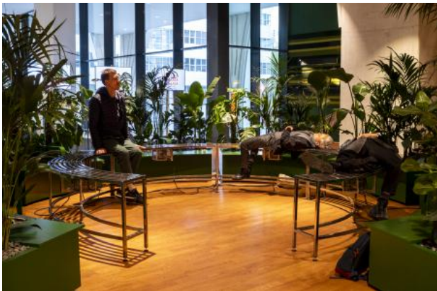
The Circular Contemplation Bench, 2022