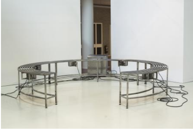
The Circular Contemplation Bench, 2022

2019 GOGBOT festival, Enschede Einscheide, Nederland Nomination