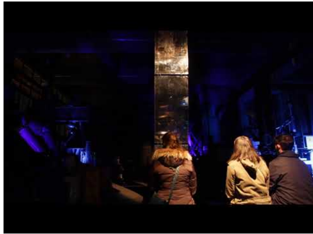
Nada Nuevo Hightlight Delft, 2020