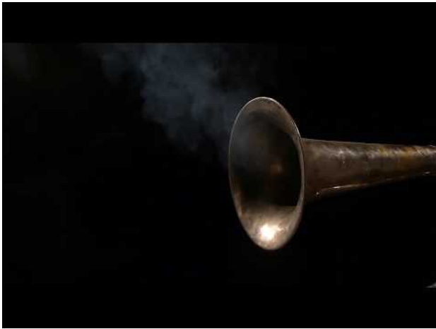
The Last Song of a Two Stoke Engine, 2020