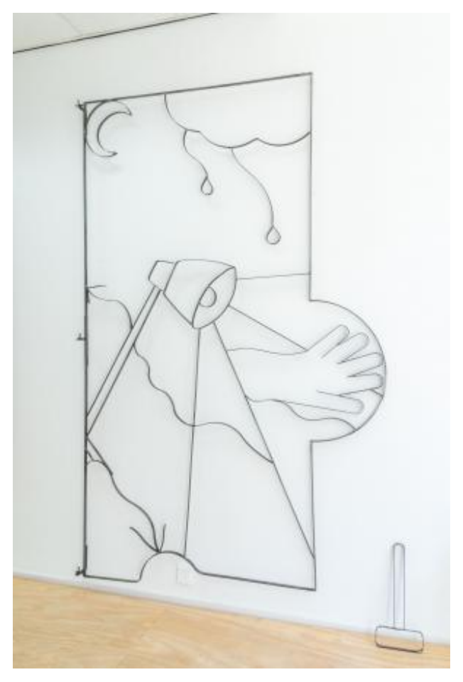
Fully Worktioning. The Balcony , 2023 \,