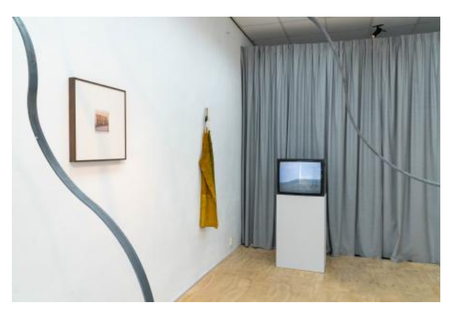
Fully Worktioning. The Balcony , 2023