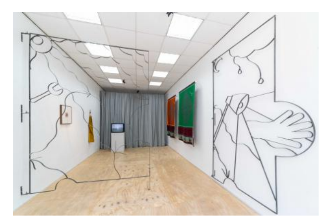
Fully Worktioning. The Balcony , 2023 \,