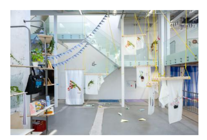
BAK. Ultradependent Public School, 2023