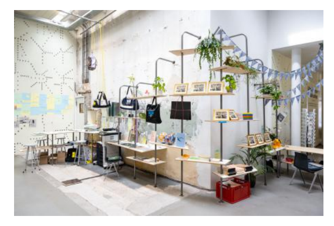
BAK. Ultradependent Public School, 2023