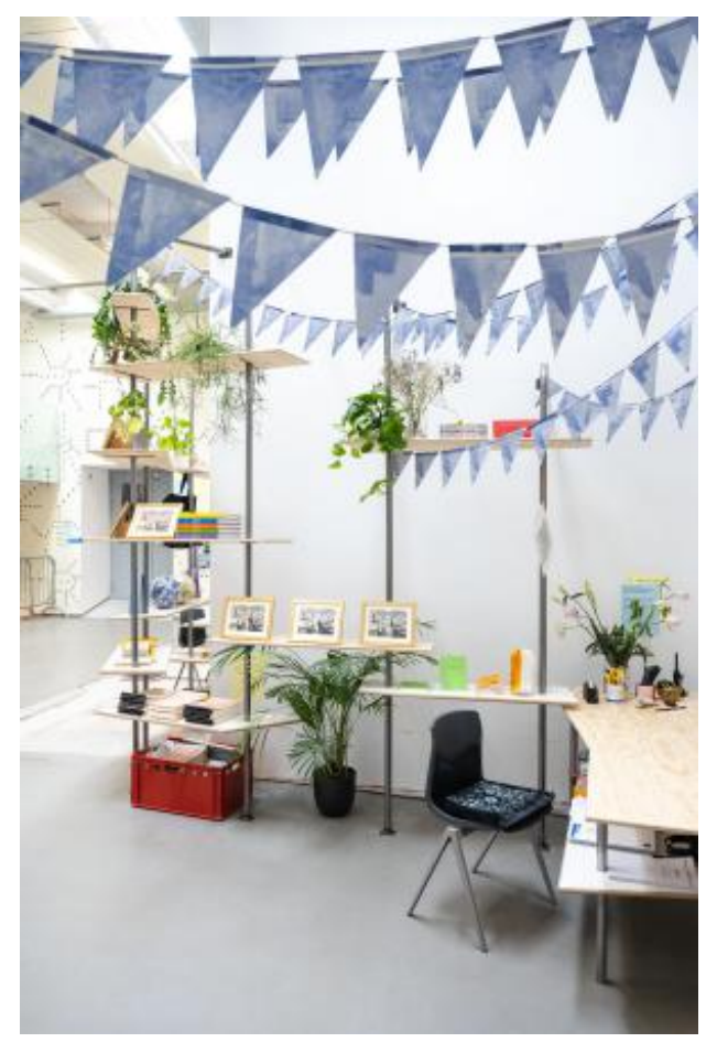
BAK. Ultra dependent\ Public\ School\ ,\ 2023