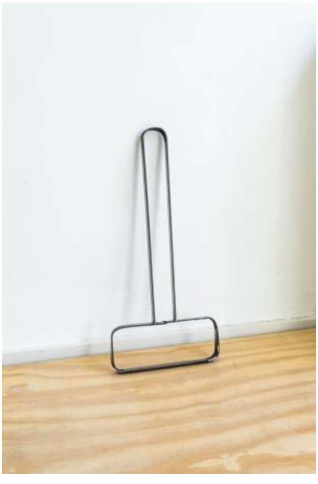
Fully Worktioning. The Balcony, 2023