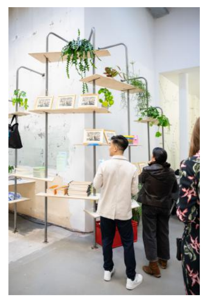
BAK. Ultradependent Public School , 2023