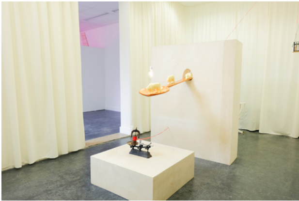
Meet tiger and go on, 2019 Welding, Molding, , room scale installation