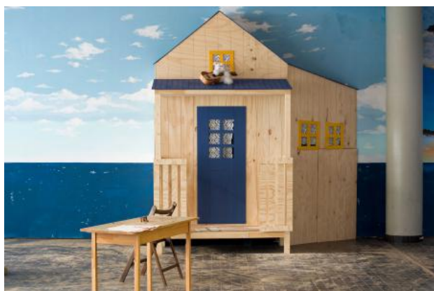
Beautiful sunset, 2023

2007 - Drawing and design teacher at 2018 Suidobata art school,