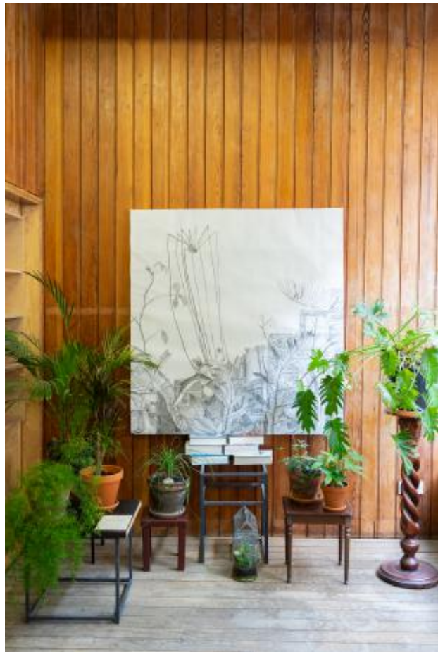
My room owner, 2022 hand drawing, pencil, 143cm x 143 cm