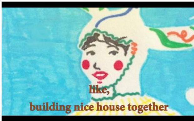
A boring story, 2022 digital animation (3:29)