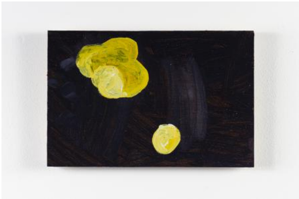
untitled, 2023 Oil paint on board, 30x20cm