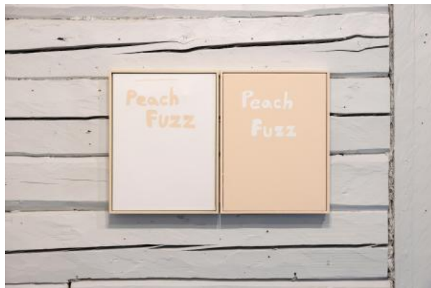
Peach fuzzz, 2024 oil paint on canvas (framed), 30x40cm