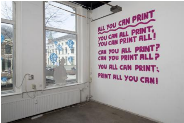
All You Can Print, 2023 Emulsion on wall