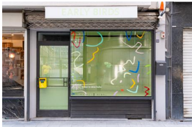
Early Birds, 2023