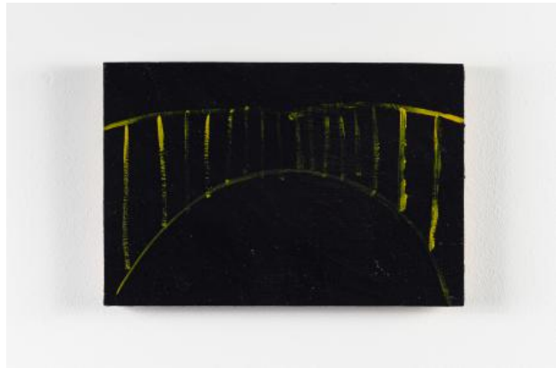
untitled , 2023 Oil paint on board, 30x20cm