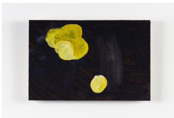
untitled, 2023 Oil paint on board, 30x20cm