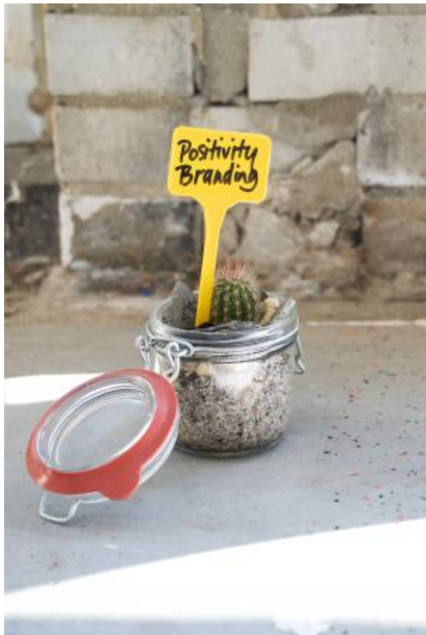
Acts of Opening #2: Kunst_Pflanzen, 2021