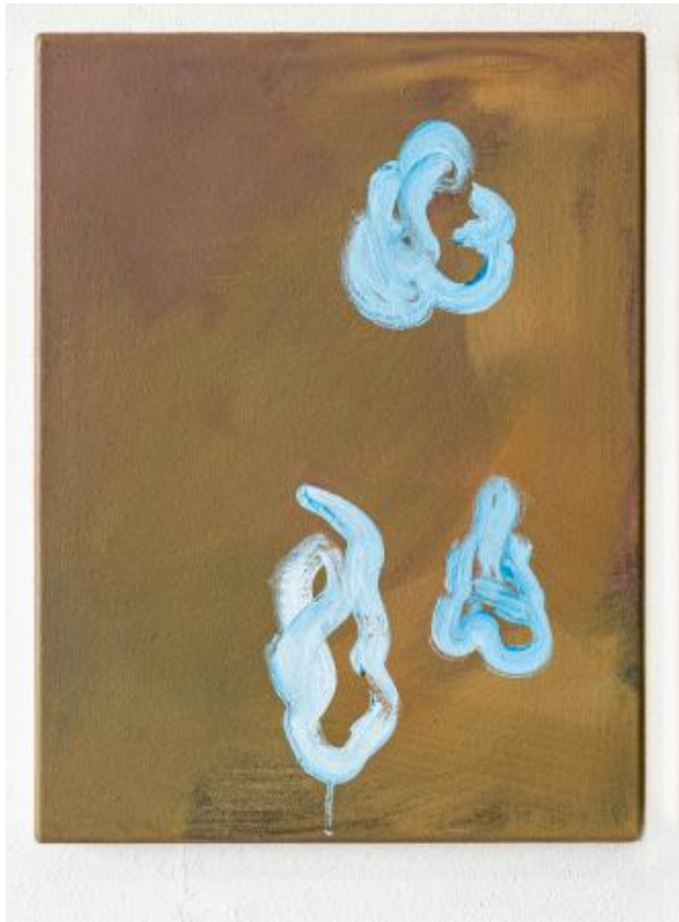
, 2023 Oil on Canvas , 30x40cm