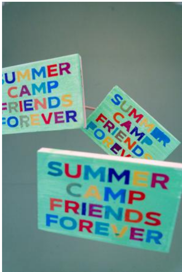
Early Birds, 2023