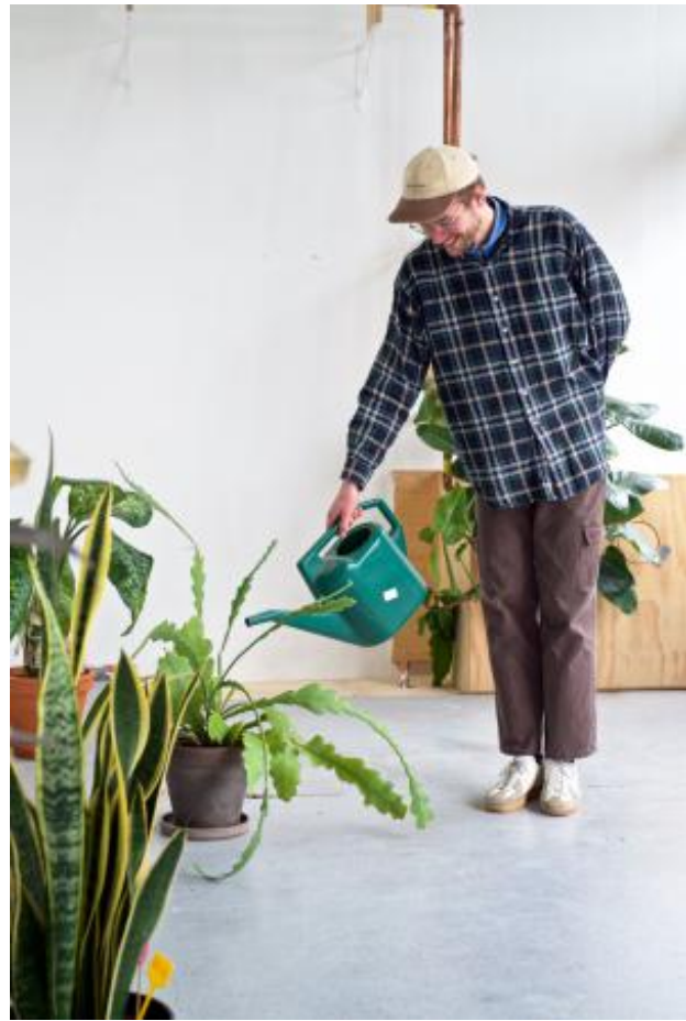
Acts of Opening #2: Kunst_Pflanzen, 2021