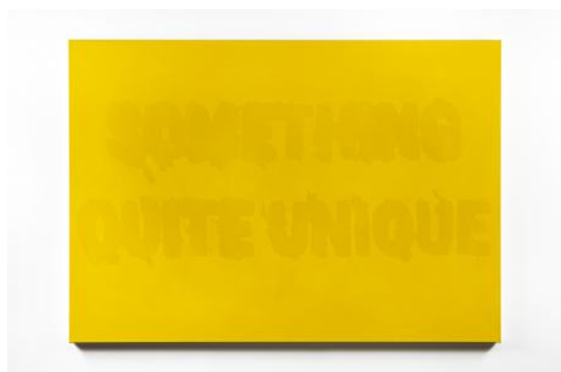
Something Quite Unique, 2023 Oil paint on cotton , 170x110cm

2019 - Hgtomi Rosa (Artist initiative) Loopt nog 2275