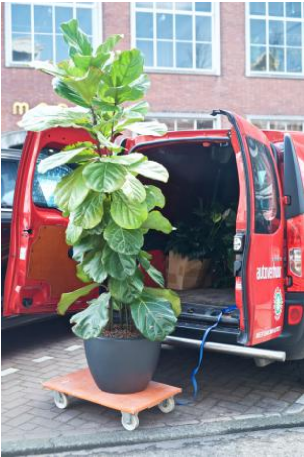
Acts of Opening #2: Kunst_Pflanzen, 2021