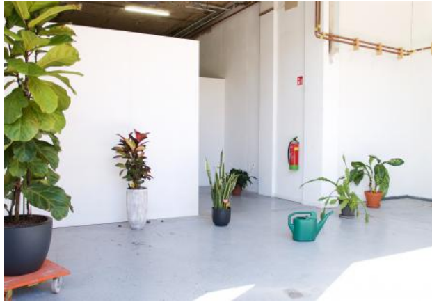
Acts of Opening #2: Kunst_Pflanzen, 2021