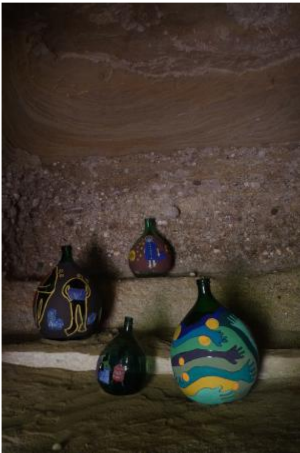
Dames Jeannes, 2024 gouache, variable