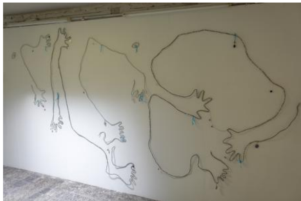
Unnecessary Details, 2024 Beads, agriculture rope, key hangers, drawings and photographs, approx 2mx2m