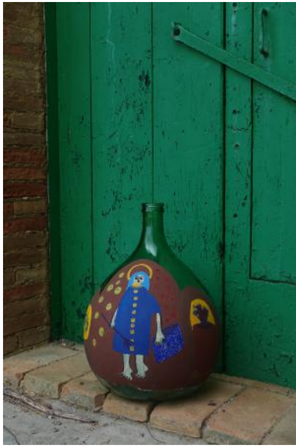
Dames Jeannes, 2024 gouache, variable