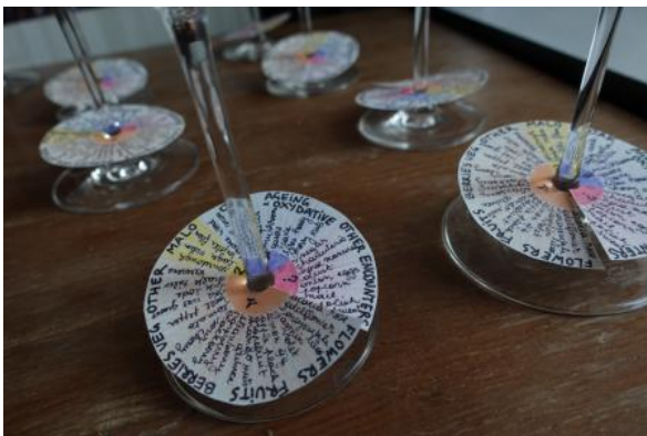
Vinous Landscapes #3 Wijnbergen, 2024 Performance