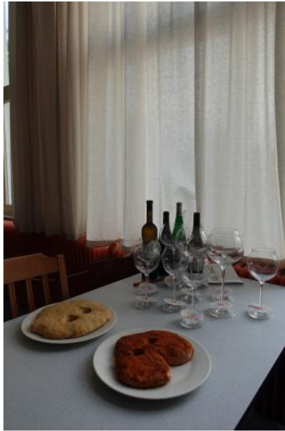
Vinous Landscapes #3 Wijnbergen, 2024 Performance