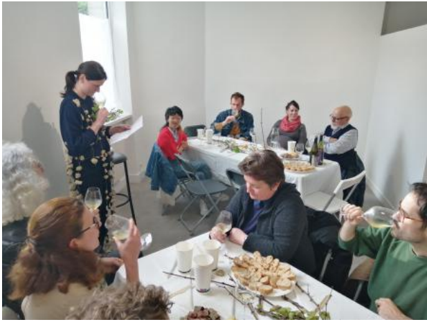
Vinous Landscapes #2 The Land is a coat of mail, 2023 Wine tasting performance