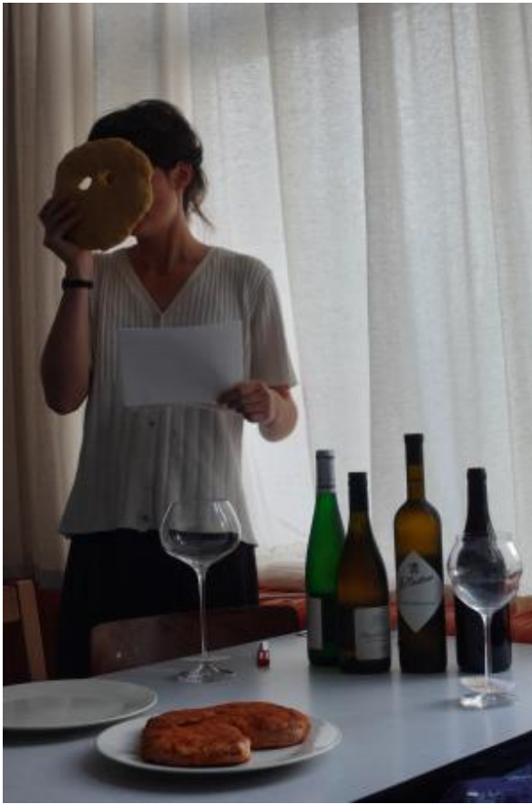
Vinous Landscapes #3 Wijnbergen, 2024 Performance

Unnecessary Details, 2024 Beads, agriculture rope, key hangers, drawings and photographs