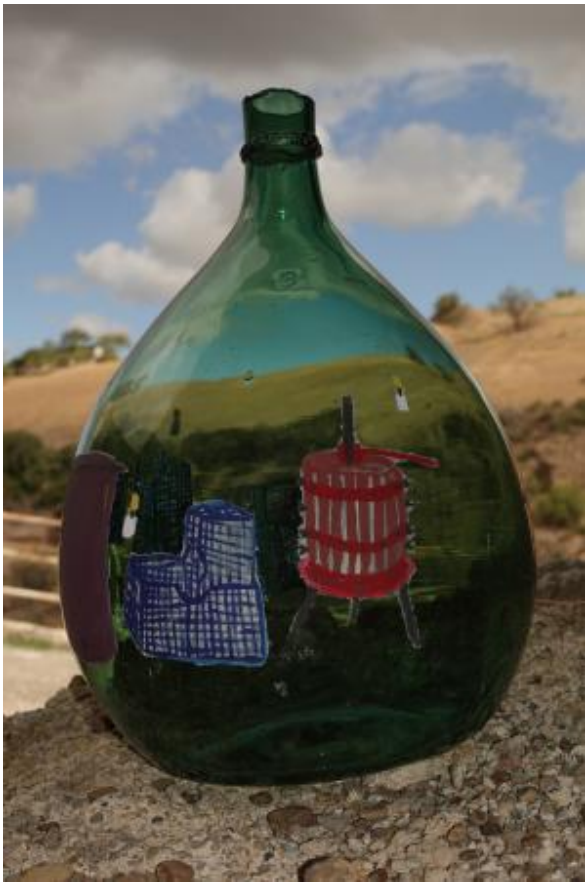
Dames Jeannes, 2024 gouache, variable