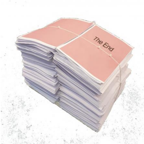
You are sitting on it, 2022