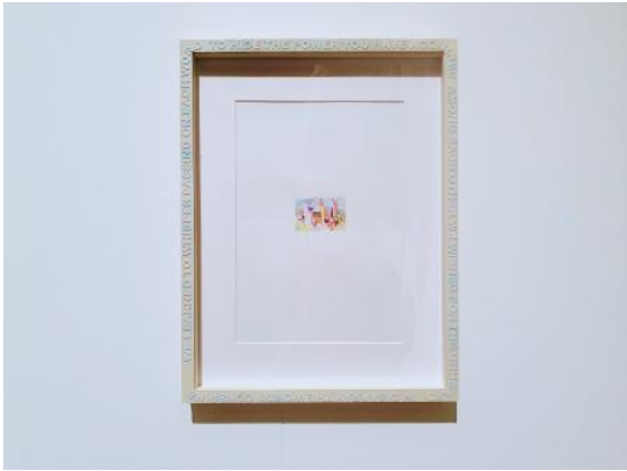
To hide the power you have acquired, 2024 Acryl on hahnemühle-paper, wooden frame, 50 x 40 cm

2014 - Member of FRANK Gallery & Studios, 2016 Malmö, Sweden