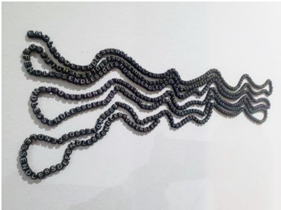
ENDLESSDEFENDLESS, 2024 Acryl, wood, 50 x 30 cm