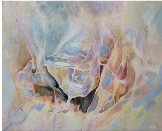
Perservere, 2024 Acryl and heatgun on canvas, 60 x 50 cm