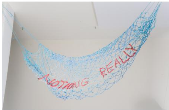
Nothing really, 2022 Handdyed and tied cotton rope