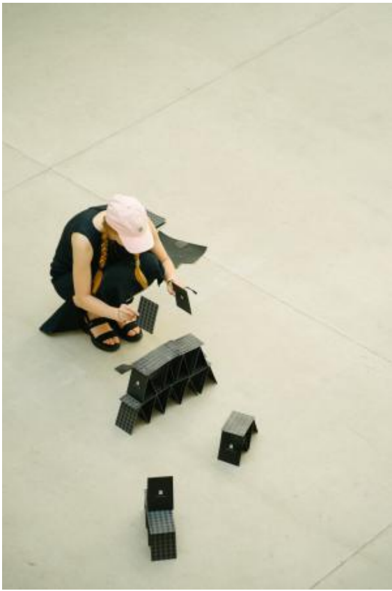
Who's laughing now, 2023 Performance, -