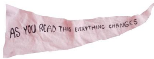
As you read this everything changes, 2022