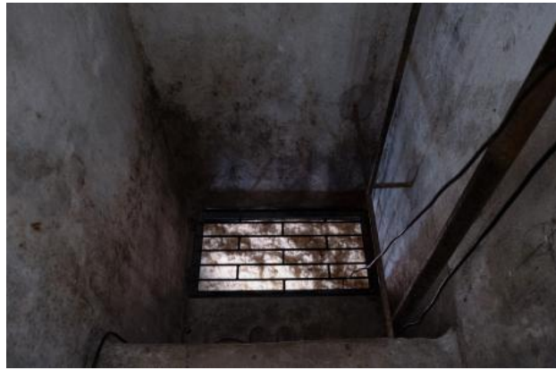
A Choral Accomplishment, 2024