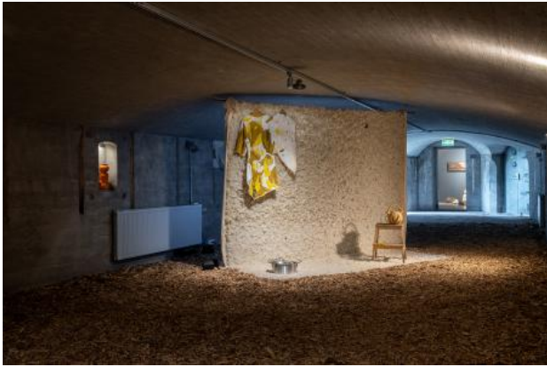
A Choral Accomplishment, 2024

horse is a horse of course, of course, 2024 digital video Full HD, 75" screen, pool noodles, pommel horse with stirrup