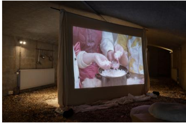
A Choral Accomplishment, 2024