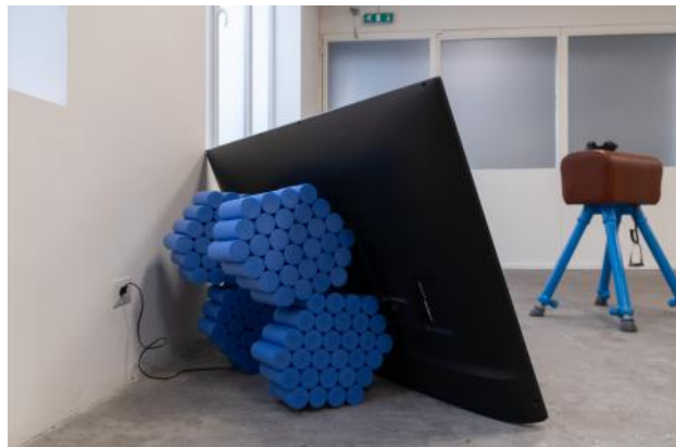
horse is a horse of course, of course, 2024 digital video Full HD, 75" screen, pool noodles, pommel horse with stirrup