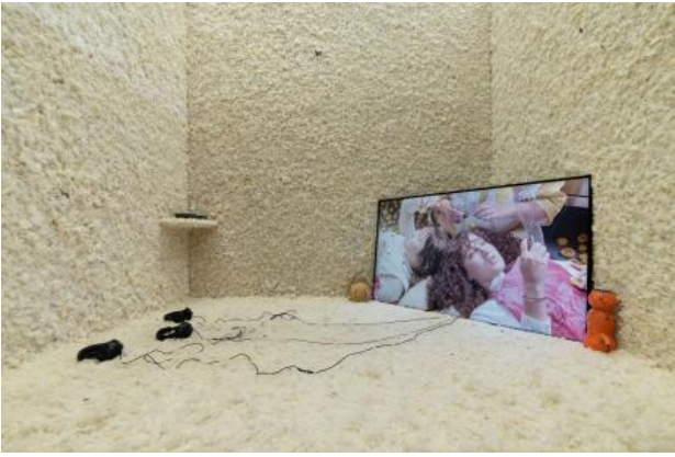
A Choral Accomplishment, 2024 4k video, wool covered room, ceramics