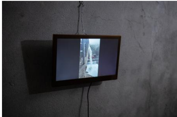
A Choral Accomplishment, 2024