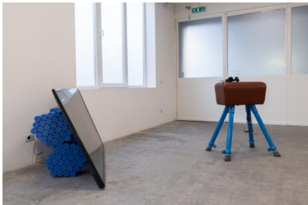
horse is a horse of course, of course, 2024 digital video Full HD, 75" screen, pool noodles, pommel horse with stirrup