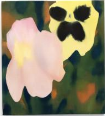
Bratki, 2023 oil on canvas , 40 x 45 cm