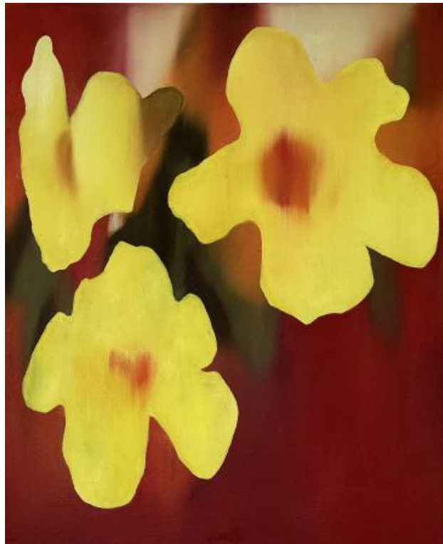
Ipe Amarelo, 2023 oil on canvas , 45 x 55 cm