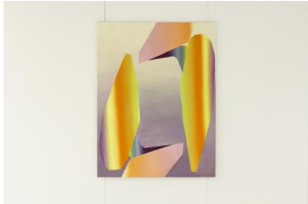
Strelitzia flower, 2022 oil on canvas, 155 x 115 cm