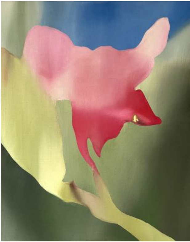
Flower Fantasia III, 2023 oil on linen , 40 x 45 cm