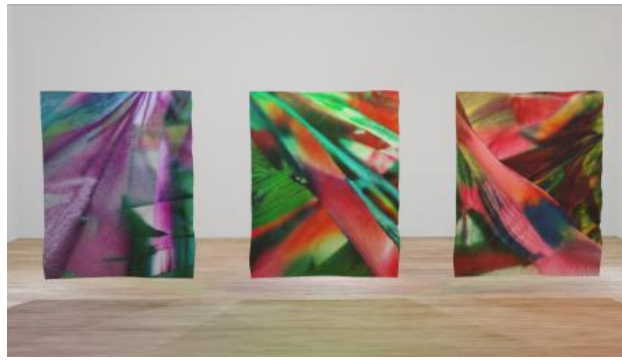
, 2022 Mixed media on fabric, 150x100cm