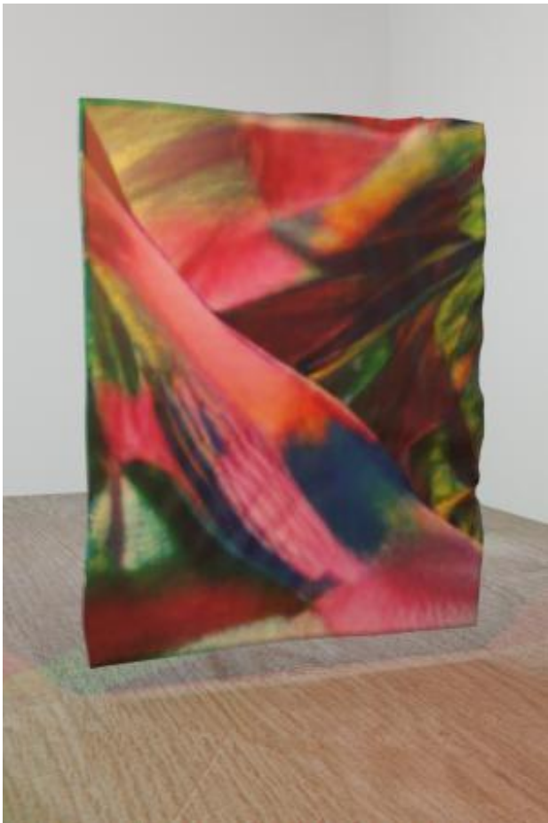
, 2022 Mixed media on fabric, 150x100cm