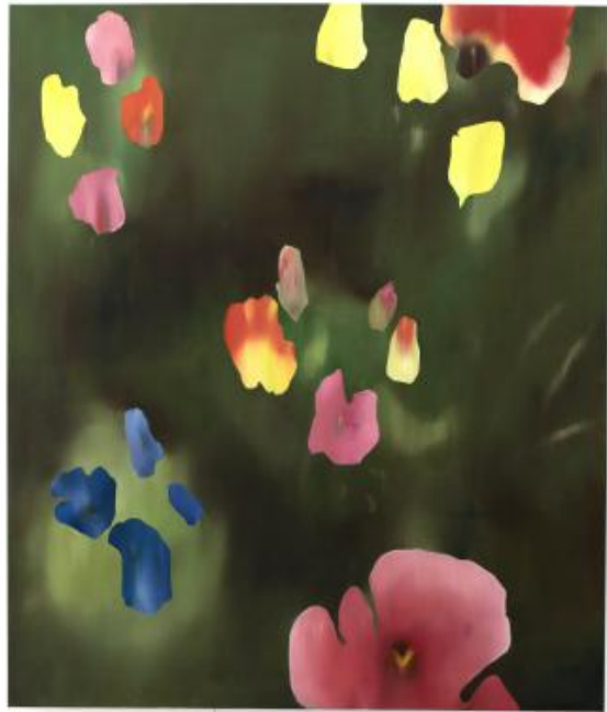
Flower Field I, 2023 oil on canvas , 145 x 110 cm