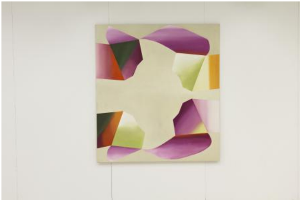
Turns in pink, 2022 oil on canvas, 135 x 145 cm