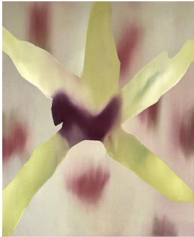
Flower Fantasia I, 2023 oil on canvas , 50 x 55 cm