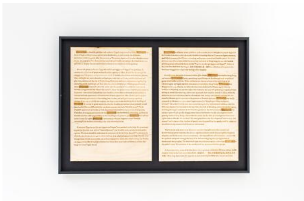
What Kinds Of Times Are These, When To Talk About Trees Is Almost A Crime, 2023