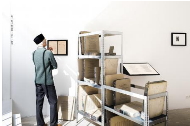
What Kinds Of Times Are These, When To Talk About Trees Is Almost A Crime, 2023