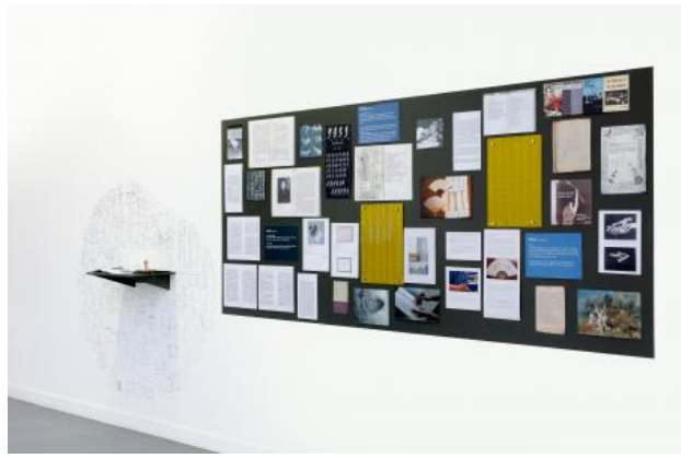
Scold, Gossip and Siren, 2023