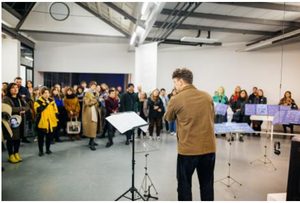
Siren, as part of Scold, Gossip and Siren, 2023