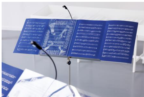
Siren, as part of Scold, Gossip and Siren, 2023