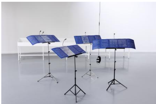
Siren, as part of Scold, Gossip and Siren, 2023