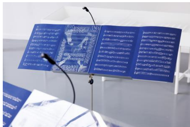
Siren, as part of Scold, Gossip and Siren, 2023