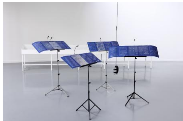
Siren, as part of Scold, Gossip and Siren, 2023

2017 - Galerie Perrotin (Assistant to Director | 2019 Gallery Assistant, Sales & Artist Liaison)