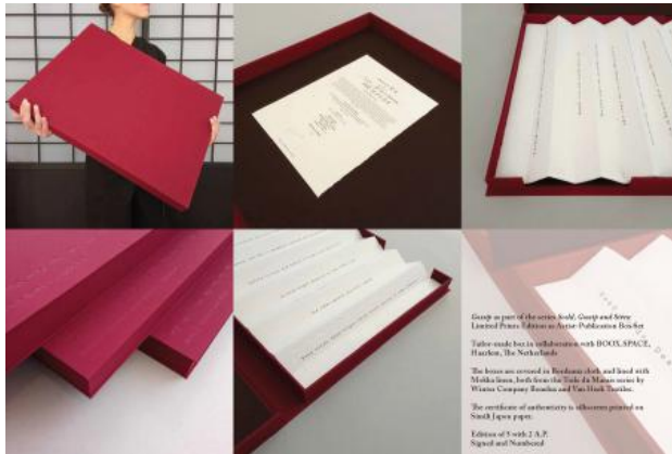
Gossip as part of the series Scold, Gossip and Siren, 2023