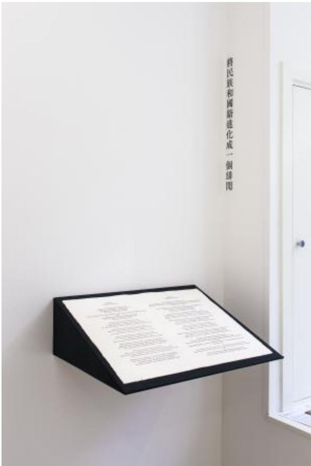
What Kinds Of Times Are These, When To Talk About Trees Is Almost A Crime, 2023