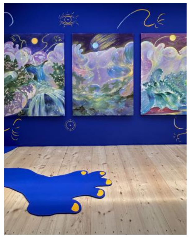
Battle Ground, 2024 Oil, acrylic on canvas, 160 x 120 cm