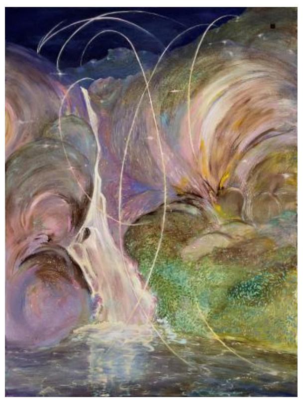
Battle Ground, 2023 Oil, acrylic on canvas, 160 x 120 cm