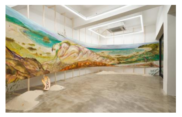
Buffer Zone, 2021 Oil, acrylic on canvas, 157×955.5cm