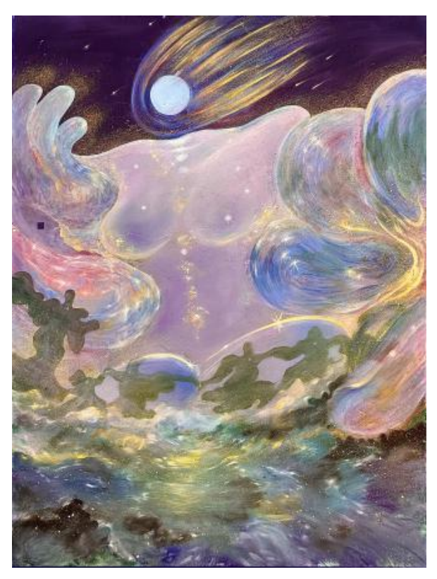
Battle Ground, 2023 Oil, acrylic on canvas, 160 x 120 cm