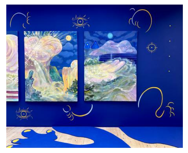
Battle Ground, 2024 Oil, acrylic on canvas, 160 x 120 cm