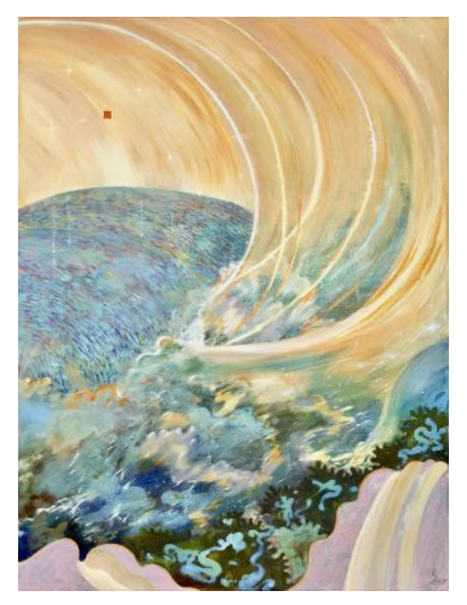
Battle Ground, 2023 Oil, acrylic on canvas, 160 x 120 cm