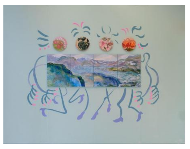
Landscape from our ancestress , 2023 Oil on canvas, 70 x 200 cm \,