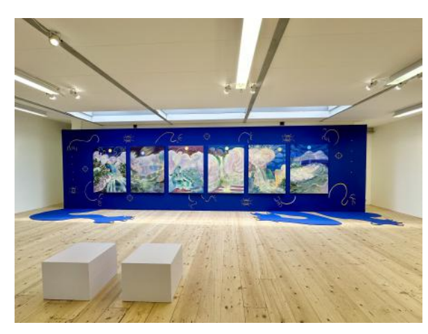
Battle ground series, 2024 Oil, acrylic on canvas, 160 x 120 cm, 6pieces