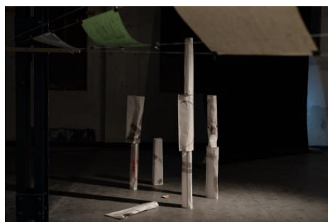
One, none, hundred thousands Drops., 2024 papers sewed together, typewritten, ink stamps, 1x1x3m