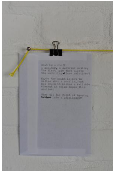
The Roof we made, 2024 typewriter on letter envelope, A5