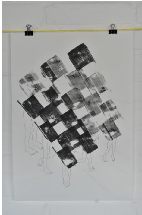
The Roof we made, 2024 drawing, typewriter, ink, chalkline, A3