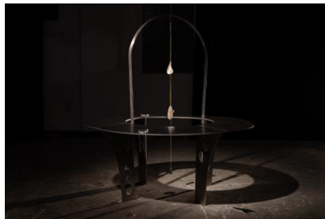
One, none, hundred thousands Drops., 2024 Aluminium laser-cutting and welding, 170x170x170cm