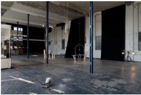
One, none, hundred thousands Drops., 2024