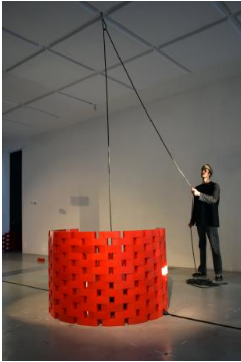
As Common as Well, 2023 ruber bricks, rope, hook