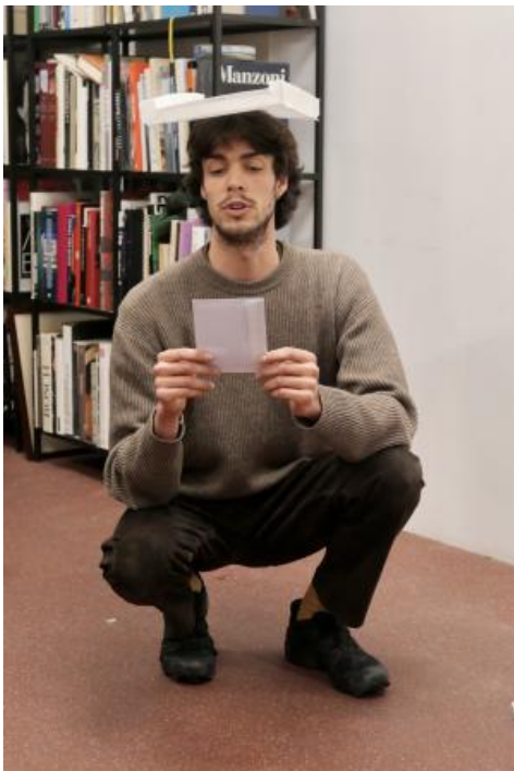
The Roof we made, 2024 sewed papers, typewriting, 40x30x3