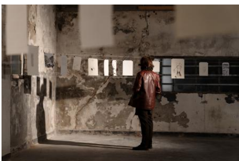
One, none, hundred thousands Drops., 2024 typewritten, drawing, ink, mix, A4, A3