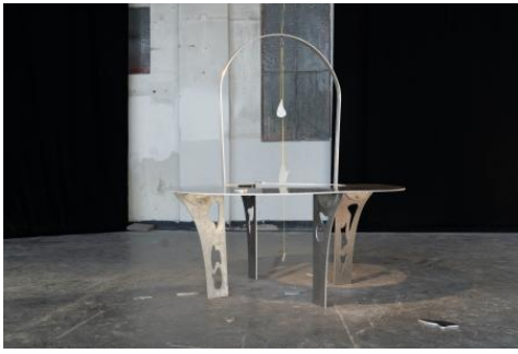
One, none, hundred thousands Drops., 2024 Aluminium laser-cutting and welding, 170x170x170cm