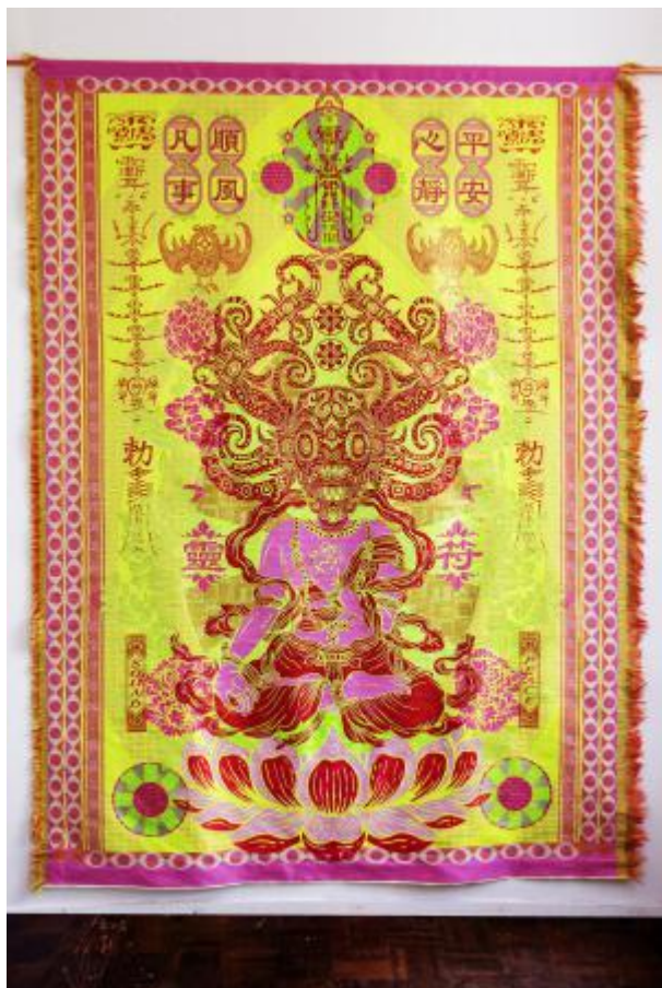
Thread in Loving Mother's Hands, 2023 Industrial Jacquard Weaving , 170 x 225 cm