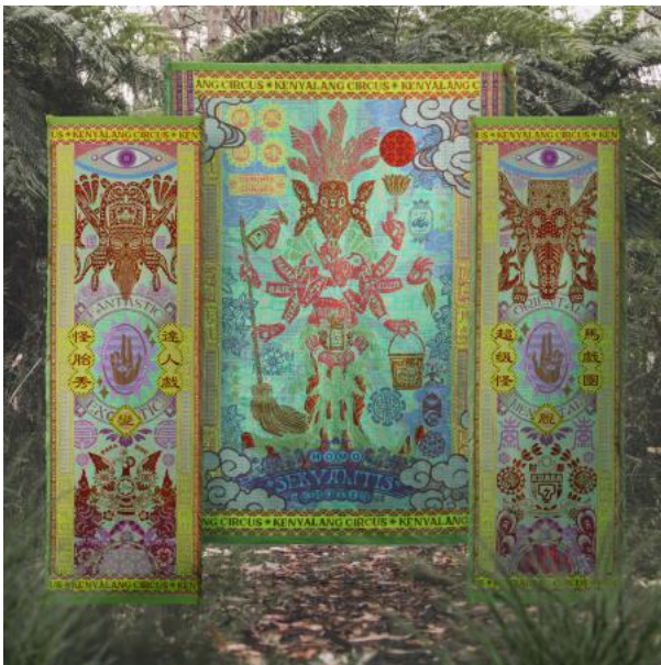
KENYALANG CIRCUS Woven Poster #10: Homo Servantis Erotis, 2023 Industrial Jacquard Weaving , 3 x 2.25 m