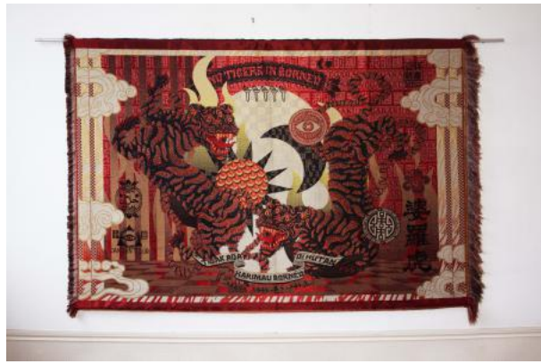
National Identity: No Tigers in Borneo, 2024 Industrial Jacquard Weaving , 1.70 x 1.10 m