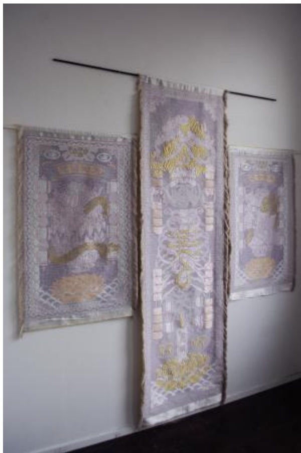
HUNGER, 2023 Industrial Jacquard Weaving , 240 x 225 cm