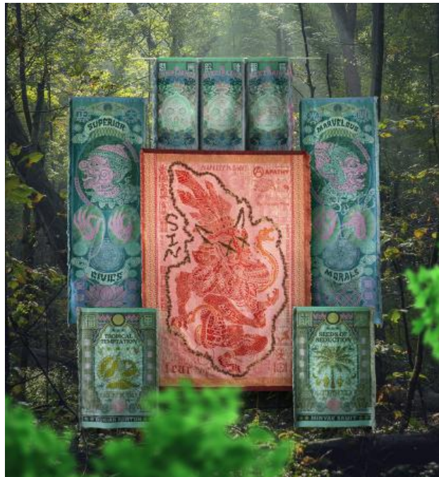
MONYET MERAH, 2023 Industrial Jacquard Weaving , 300 x 300