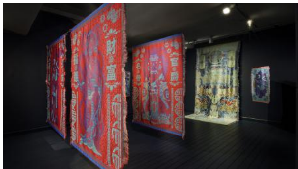
Three Contemporary Prosperities, 2023 Industrial Jacquard Weaving , Installation