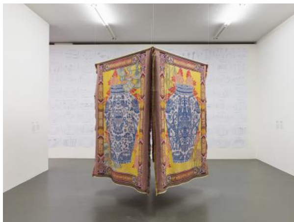
Expecting, 2023 Industrial Jacquard Weaving , 170 x 170 x 235