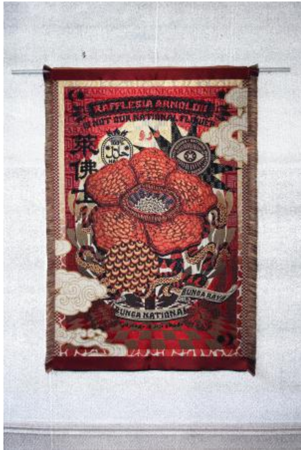
Woven Postcard: Rafflesia is not our National Flower, 2024 Industrial Jacquard Weaving , 75 x 110 cm