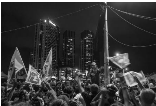
From the project 'Aragalayata Jaya', 2022 Digital Photography