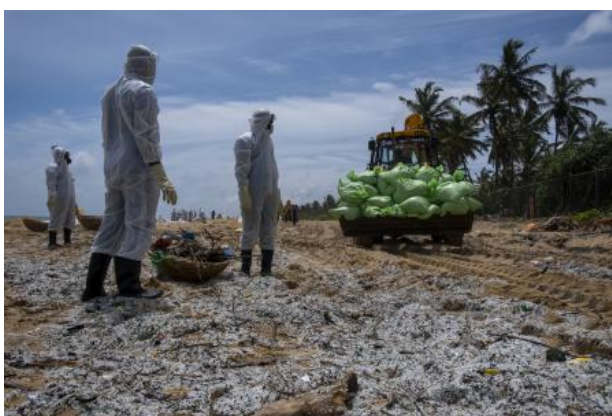
From the documentation of the X-Press Pearl marine disaster in Sri Lanka, 2021 Digital Photography