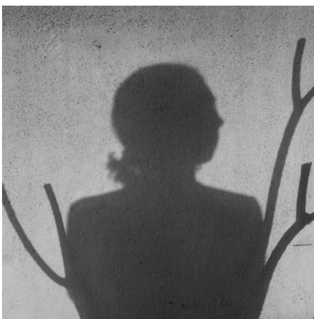
From the project 'Life in Limbo', 2021