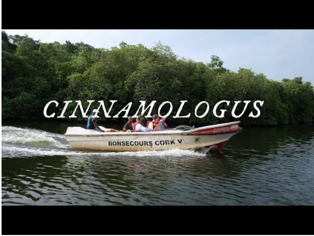
Cinnamologus, 2024 7 minutes