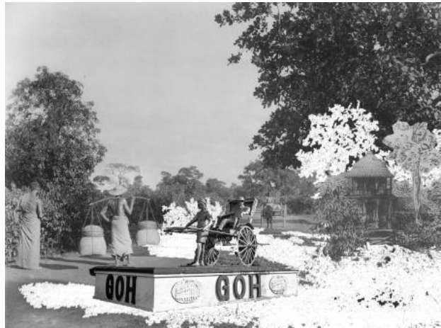
Digital Collage 'Cinnamon Gardens', 2024 Digital Collage