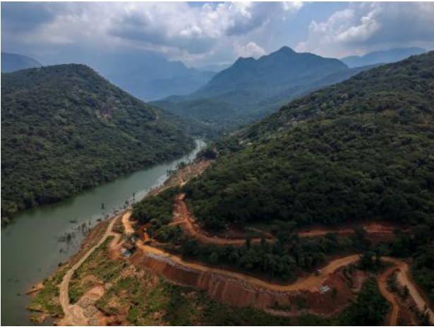
From the project 'Great Sandy River', 2020 Digital Photography