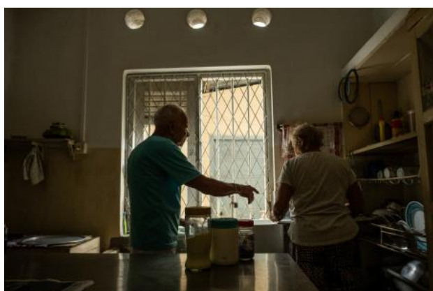
From the project 'Monsoon milk tea', 2021 Digital Photograph