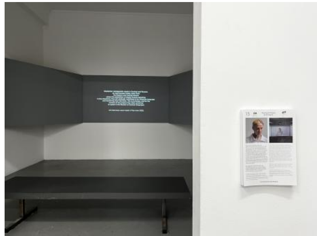
I Don't Think I'll Stay Here Long 2023, 2023 Three-channel installation