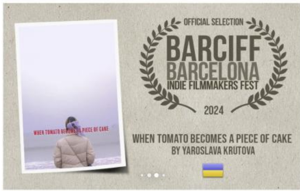
When tomato becomes a piece of cake, 2024 Short film