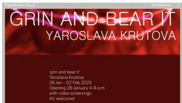
Grin and bear it, 2025 Mixed media