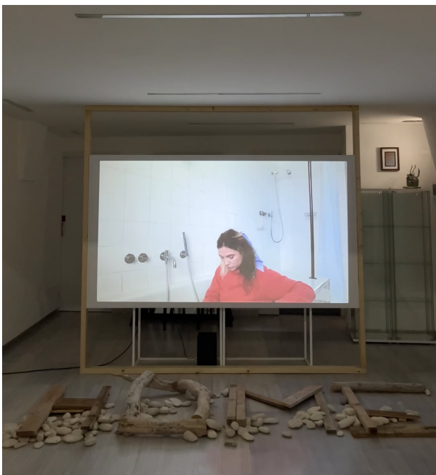
When tomato becomes a piece of cake, 2023