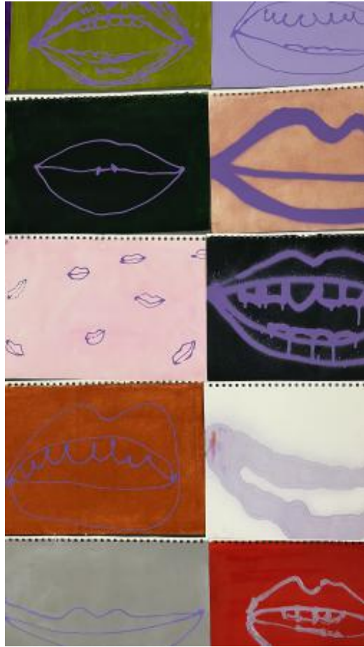
Grin and bear it, 2025