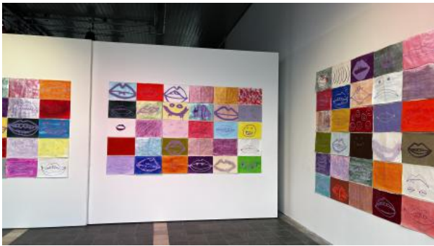
Grin and bear it, 2025 Acril, Watercolour, Soft pastel, Ink, Marker, 29,7cm * 42cm