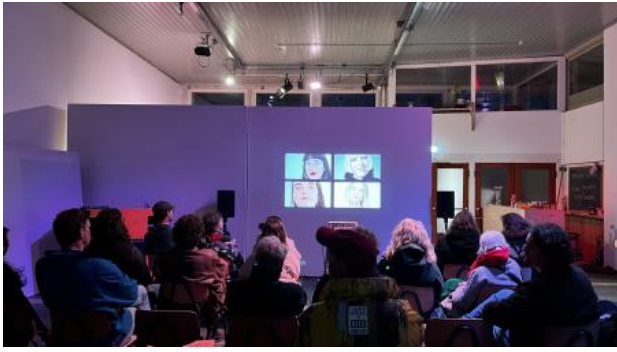
Grin and bear it, 2025 Short film