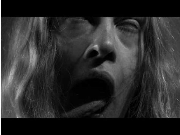
I AM, 2020 1:19