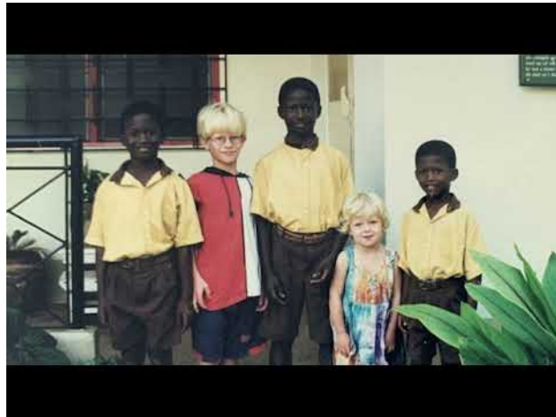
copy of copy of copy of happiness, 2021 7:07