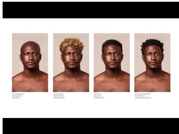
Lissom, 2021 6:01