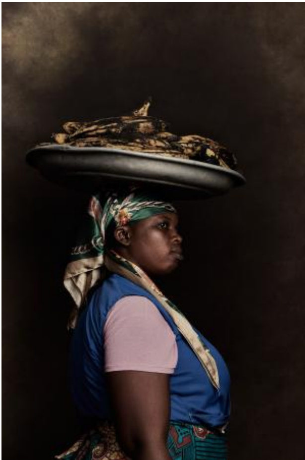
SUNSUM, 2023 Photography, 70 x 90 cm