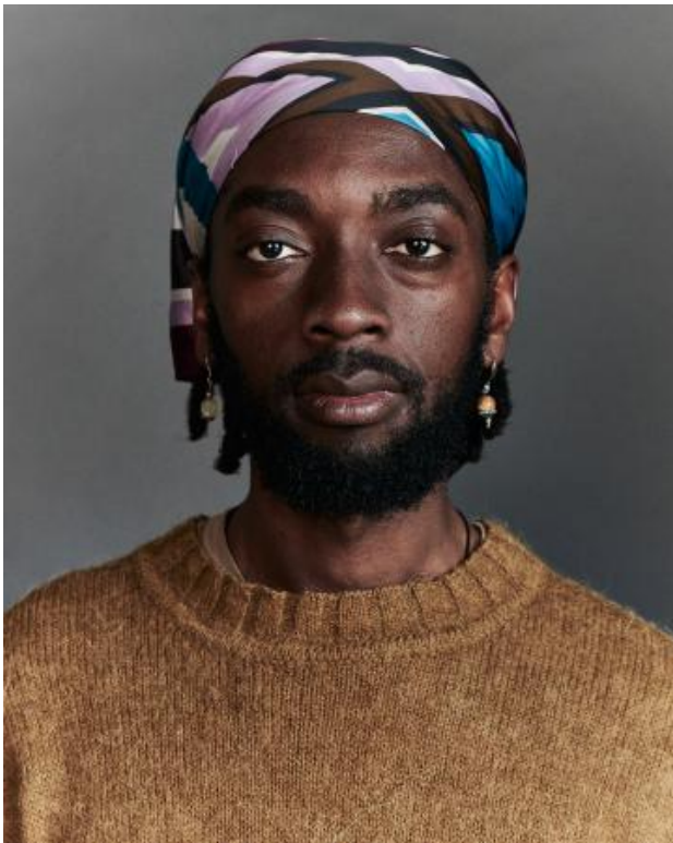
SILHOUETTE Photography, Augmented Reality, 100 x 125 cm / 60 x 75 cm