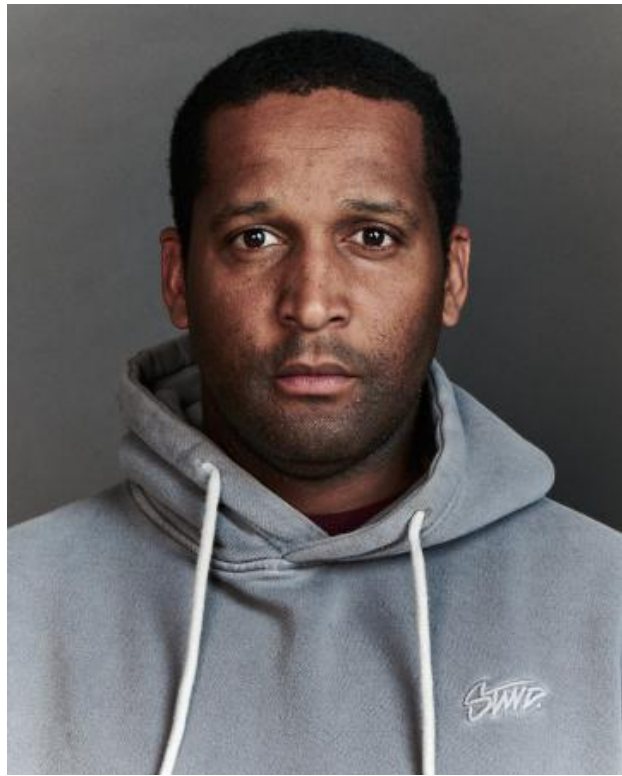
SILHOUETTE Photography, Augmented Reality, 100 x 125 cm / 60 x 75 cm