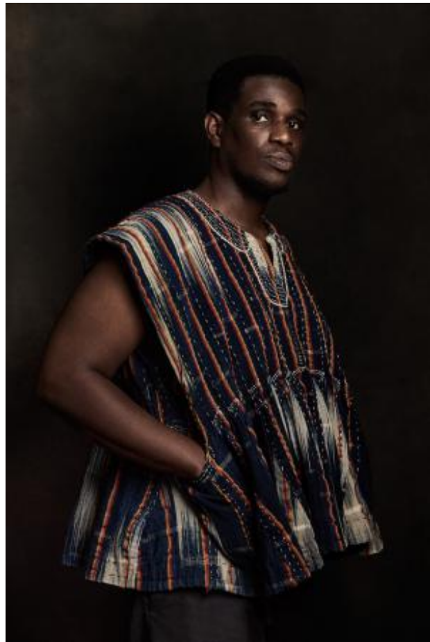
SUNSUM, 2023 Photography, 70 x 90 cm