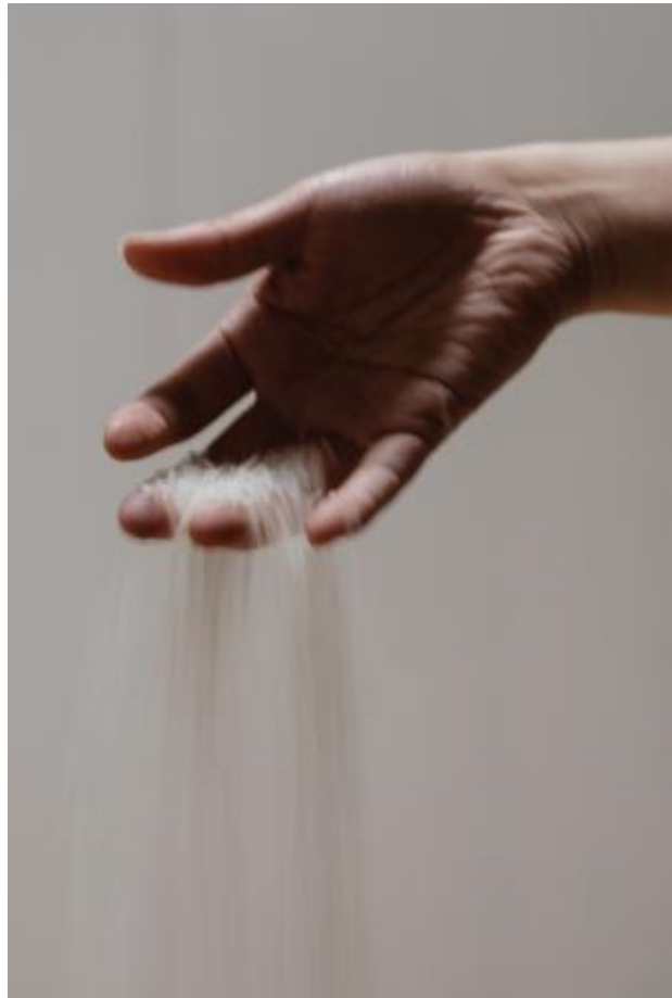
Leaking Mother Tongue, 2023 digital