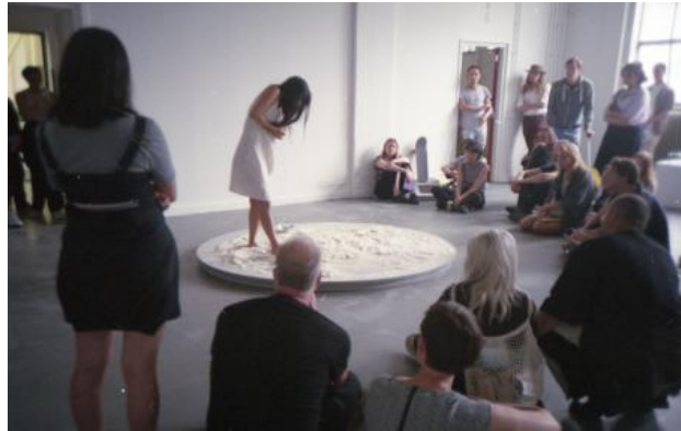
Leaking Mother Tongue, 2023