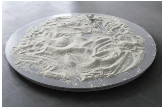
Leaking Mother Tongue, 2023 white rice, frozen milk, diameter : 217 cm | hoogte: 11cm