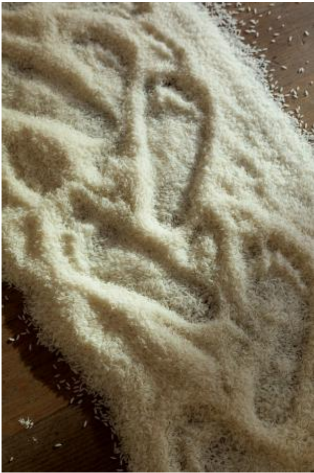
Leaking Mother Tongue, 2023 digital