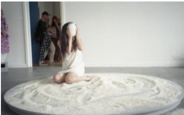
Leaking Mother Tongue, 2023