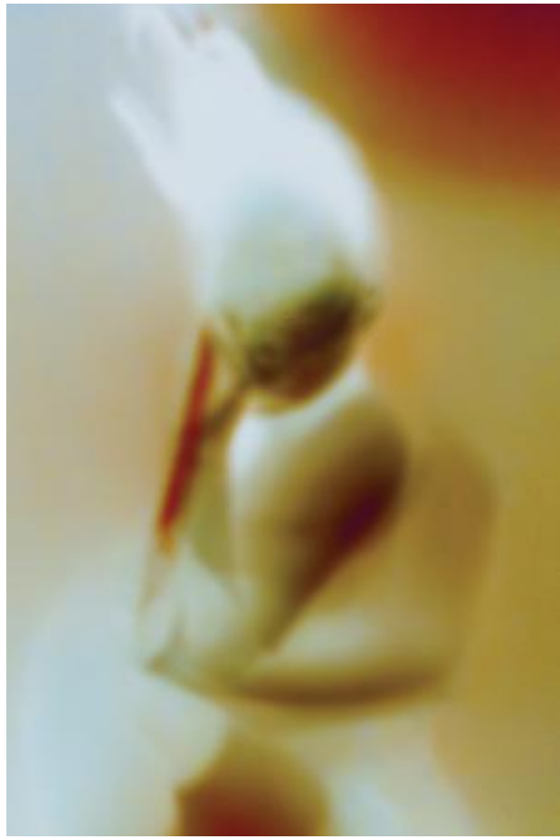
Leaking Mother Tongue, 2023 digital